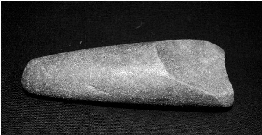
Figure 8.7 A 'thunderstone' ( batu pera'it ), once kept in a rice barn in Pa' Dalih