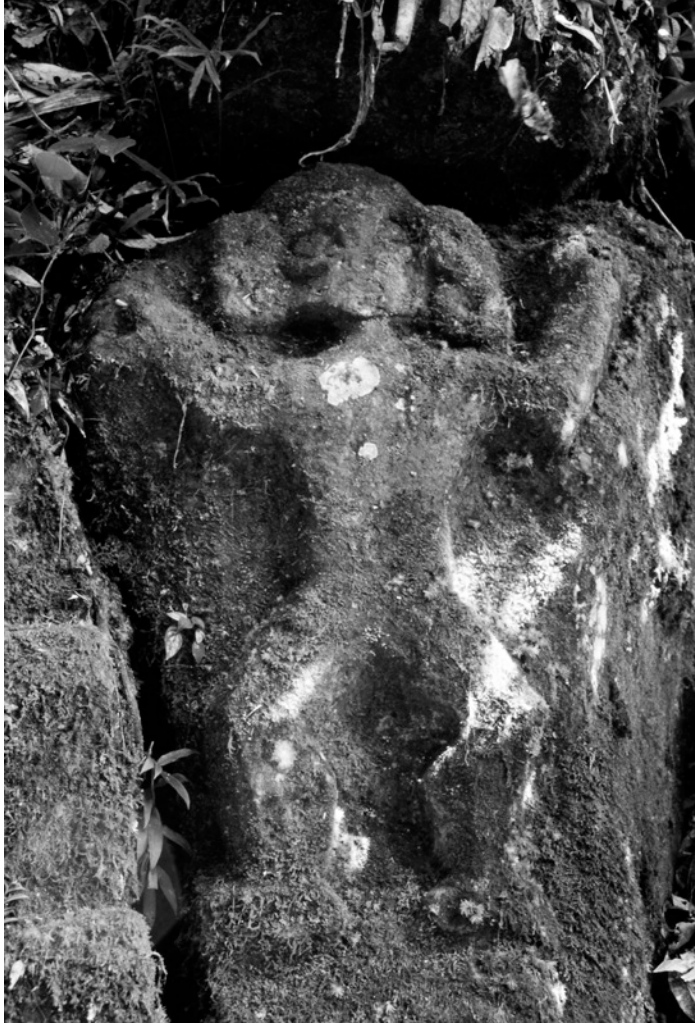
Figure 8.8 A carved stone ( batu narit ) near the abandoned Kelabit settlement of Pa' Bengar, said to have been made at an irau feast in the past

An earthwork built to make or extend late baa is described as a form of ‘mark’ or etuu . Other marks were made by setting up standing stones, carving stones (see Figure 8.8), digging ditches on ridges (often to create a new path) and removing trees at a point on a ridge. Such marks were made, until the 1960s, at irau ate