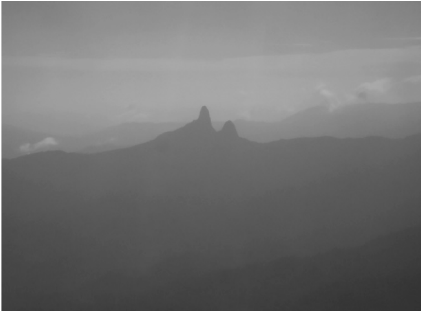
Figure 8.2 The twin stone peaks of Batu Lawi mountain, said to be male and female

Lalud does not only coalesce in humans and animals; it also coalesces in entities and substances which are – in Western terms – non-living. While lalud flows through water, hardness, and especially stoniness, is associated with the coalescence of lalud . Living things, as they become older and develop stronger ada , become more stone-like and have more lalud . Big, old trees have stronger