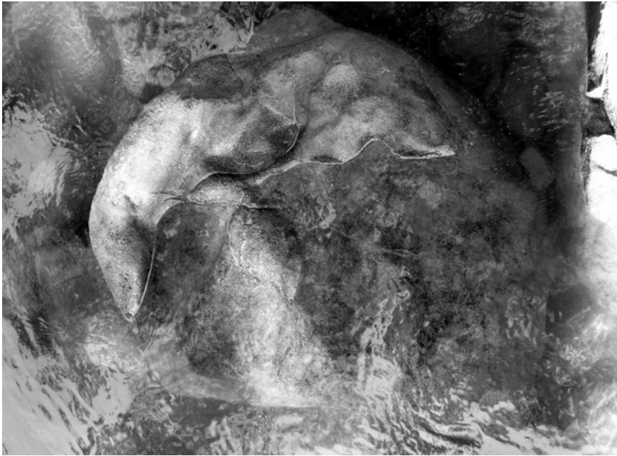
Figure 8.5 A ‘footprint’ said to have been made by the culture hero Tukad Rini on a stone in the Kelapang river