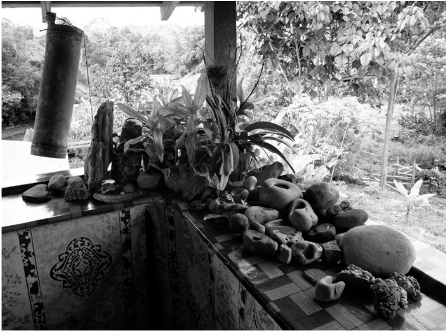
Figure 8.6 A collection of hard objects from the forest collected by Telona Bala of Pa' Dalih