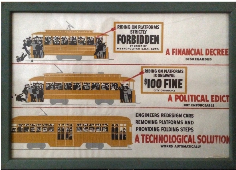
Figure 2. Later reproduction of the example of the streetcar as technological fix for social ills. As a four-color placard, the illustration was displayed in Technocracy Inc chapter houses across North America, but other versions appeared in Technocracy Inc literature between 1946 and 2001. All these later versions have inadvertently exchanged the top two text boxes of the original illustration, suggesting that the message was visually absorbed rather than analyzed. (Reproduced in various grayscale versions in Bounds, “What’s Yours is Mine,” 7; Palm, “Why North America Faces Social Change,” 9; ‘L.L.B.’, “Subsidies and Sabotage,” 22; Technocracy Inc., Technocracy: Technological Continental Design . 1990 and 2001, respectively. Color placard photographed at Aldergrove, British Columbia premises of Technocracy Inc, courtesy of current Director George Wright.)