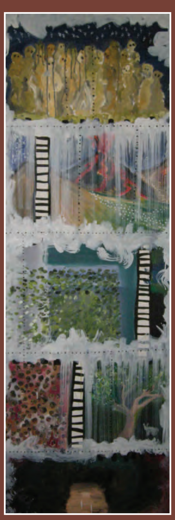
Untitled Oil on Canvas 2008