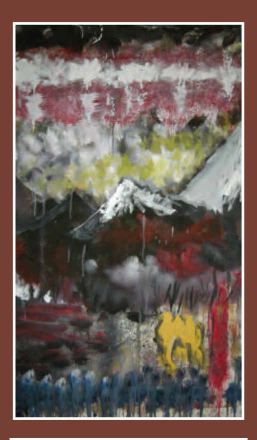
If it snowed Oil on Canvas 2007