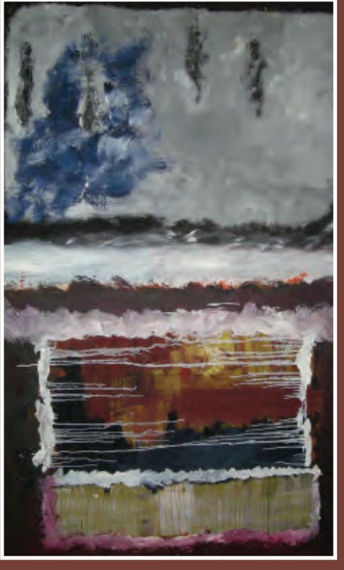
The last time I saw P Oil on Canvas 2008