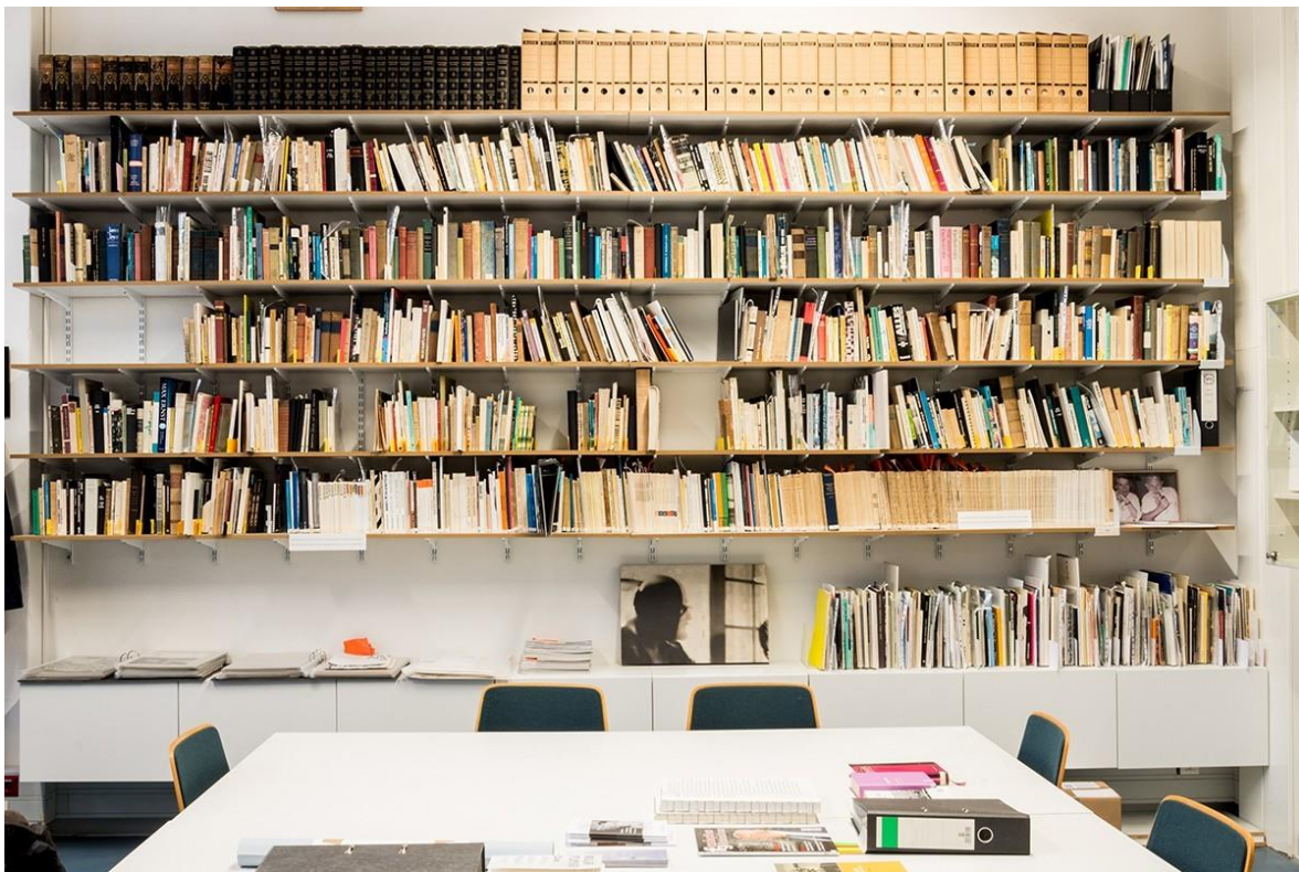
Image 1: Traveling Library of the Vilém Flusser Archive Berlin at Berlin University of the Arts 5