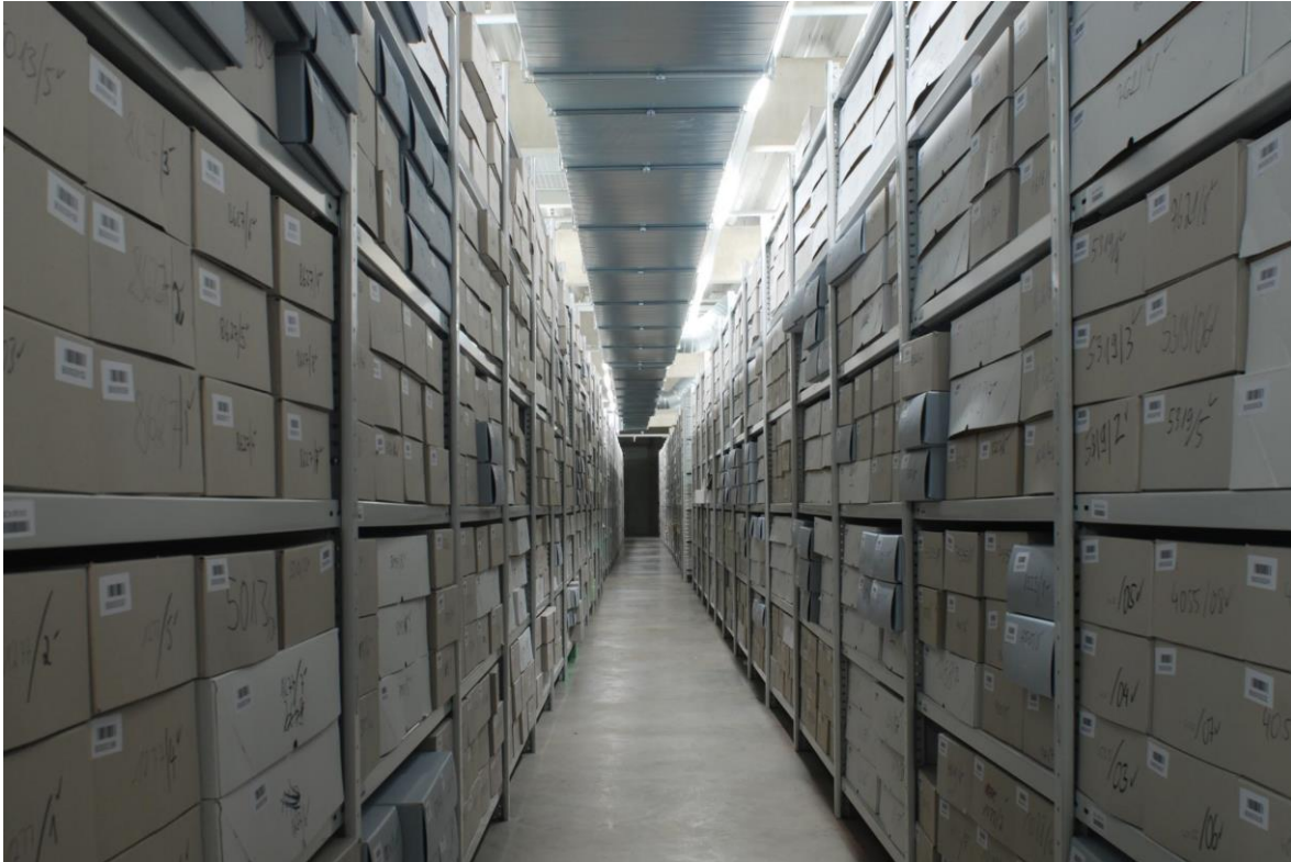
Image 2: Magazine shelves of the restoration and digitisation centre in Cologne 11

This decentralisation as well as the danger of consequential damages for the various materials, pushed forward the plan of a complete digitisation of all stocks, not least to conserve digital representations and make them simultaneously accessible to the public. A considerable proportion of the archival material is conserved in a complex manner and the possibility of loss of an indefinite number is currently not predicted. Therefore, in some cases, the digital representations might be essential for the preservation of the historical information.