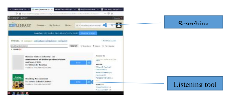
Figure 2. The open library Website

With reference to the students' fondness in gadget, research stated that each participant applied open access library as a facility to support their reading materials.