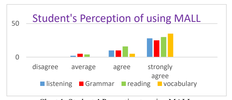
Chart 1. Students' Perception to using MALL