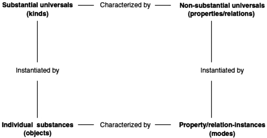
Figure 1. The ‘ontological square’, reproduced from Lowe 2006: 22.