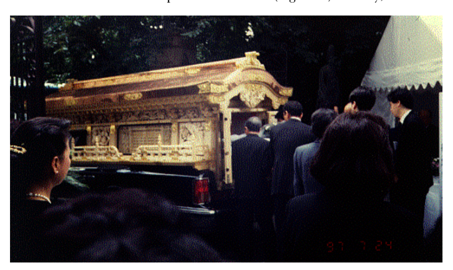
Figure 5. Departure of the hearse.

the coffin around the body of the deceased (Figure 4). A wooden staff (to aid on the post-mortem journey) or items of significance to the deceased (e.g., books, eyeglasses, food) may be placed in the coffin. The coffin is closed and mourners symbolically pound a nail into the coffin using a stone. The coffin is then carried on men's shoulders from the house or temple to the hearse (Figure 5). Finally, the chief