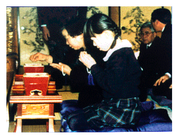
Figure 3. Incense offering by relatives of the deceased.

mourners may sit down and then stand up to burn incense (Figure 3). The chief mourner ( moshu 喪主) may make a short speech to the mourners, and the closest friends and relatives may share a meal afterwards. Often enough nowadays, in the case of a natural death in old age, mourners who were not close to the deceased arrive, sub-