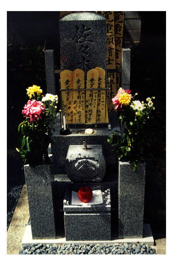
Figure 7. A family grave with offerings.

13. Interment of the bones. Forty-nine days after the death (in practice, the date is flexibly observed), the urn containing the ashes of the deceased