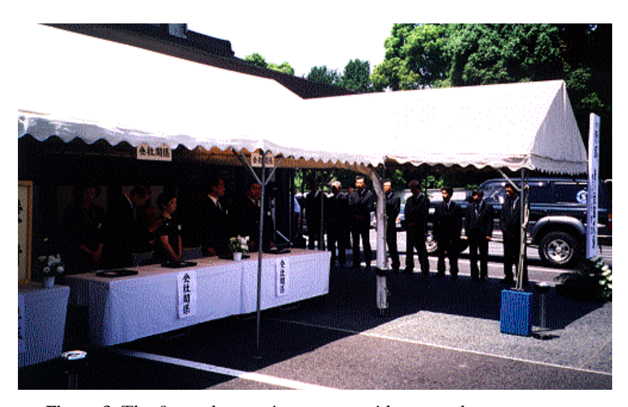
Figure 2. The funeral reception area outside a temple.

5. The wake ( tsuya 通夜). Whether the wake is held at home or in a temple, an elaborate altar is set up by the funeral company (Figure 1). When mourners arrive at the reception table outside the building, they hand over an envelope containing a cash "incense offering" ( kōden 香典) (Figure 2). Meanwhile, one or more priests recite sutras inside. The