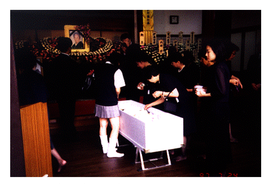
Figure 4. Placing flowers in the coffin.

the coffin around the body of the deceased (Figure 4). A wooden staff (to aid on the post-mortem journey) or items of significance to the deceased (e.g., books, eyeglasses, food) may be placed in the coffin. The coffin is closed and mourners symbolically pound a nail into the coffin using a stone. The coffin is then carried on men's shoulders from the house or temple to the hearse (Figure 5). Finally, the chief