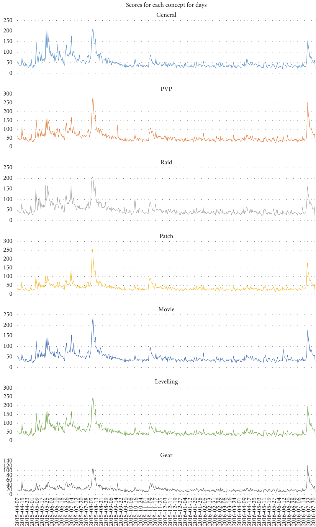
FIGURE 3: Scores of each concept for days.