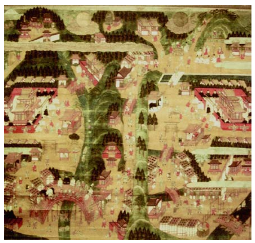
FIGURE 1: The Ise sankei mandara of the Jingū Chōkokan at Ise.

distance. Between these two points the visitor is first led to the Outer Shrine and the mountain behind it, Mount Takakura, and then goes back to the village of Okada where the street is lined with stalls selling the combs for which the village was famous. Then the pilgrim proceeds to the mountain, Ai no yama 問 の山, between the two shrines then goes back into the valley, where he crosses the famous Uji bridge 宇治橋 over the Isuzu River and advances forward to visit the Inner Shrine. From there, finally, he proceeds to another mountain, Mount Asama 朝熊山 where he visits the temple Kongō Shōji 金剛証寺 and views Mount Fuji from that temple's small oku no in 奥の院.