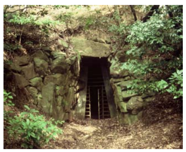
FIGURE 2: The stone structure, Ame no iwado, on Mount Takakura.

One of the concrete positive features of Ise was that the shrine precincts offered the pilgrims an opportunity to encounter the source of their life in a very real manner, when they would receive improved seed grain as "Ise miyage" 伊勢みやげ at the Outer Shrine. This seed would help them to better the results of their own crops (Kanemori 2001, 179). However, the Ise sankei mandara depicts an occasion where the pilgrim could not only pick up seed rice, but meet directly with the ultimate source of life, namely the Sun Goddess herself. The mandala promises that this meeting is not merely symbolic, but real, because it brings the pilgrim in direct contact with the world of the myths and the figure of the Sun Goddess in an event performed in the vicinity of the Outer Shrine.