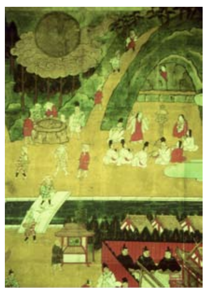
FIGURE 3: Kagura dance of a miko in front of the "Heavenly Cave" (Jingū Chōkokan).