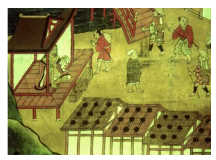
FIGURE 4: The datsue ba at the gate to Yamada town (Jingū Chōkokan).

along the pilgrims' trail. And more important, while the experience at the Heavenly Cave brings the pilgrim into contact with Amaterasu or with other deities and, therefore, with the source of life itself, the Buddhist experience is one of the world after death. This is the more remarkable, I believe, because overtly the religious world of Ise made every effort to keep any contact with death or pollution induced by contact with death outside its precincts, especially outside the space immediately around the sanctuaries. But on the Ise sankei mandala there are hints at the presence of a postmortem Buddhist other world that can be discovered at various places along the pilgrim's itinerary through the sacred realm. As a matter of fact, these hints even follow the order of events that were believed to happen after death.