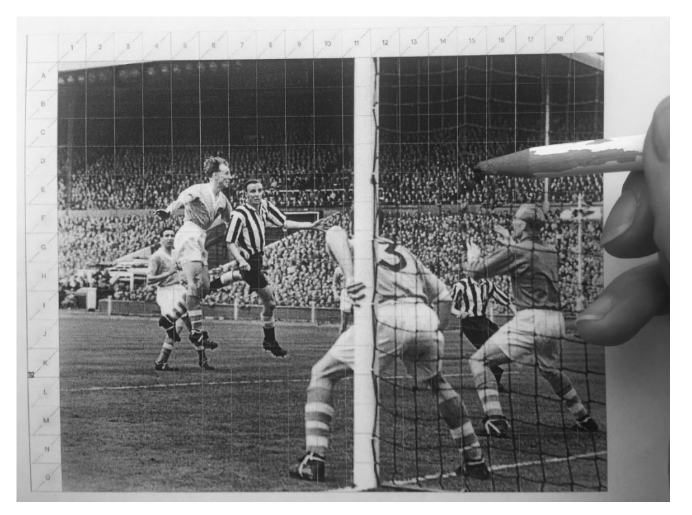
Figure 1. Spot the Ball game.

If we take the view that all things are enmeshed and entangled in a dynamic emergent system, this means the photographer works with and against many other agential, affective forces such as: the camera with its many program settings, the conventions of visual culture, a dynamic world of objects and other people and nonhuman entities which have their own temporalities and so on. Within Ingold's animistic ontology, we see that enskilled photographers and filmmakers do not propel themselves across a ready-made world but rather move through a world-information, along the lines of their relationships.