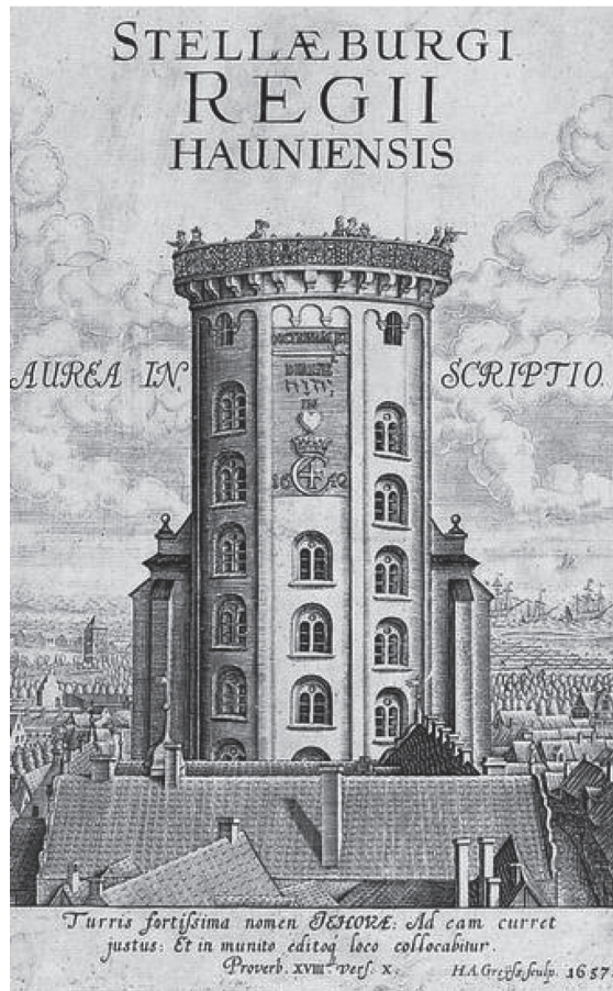
Figure 2. The Round Tower in Copenhagen with its observatory platform.

the heavens that would surpass even those uncovered by Galileo, he was sceptical with regard to its use in astronomy: “This optical apparatus [...] has not, according to my judgment, been very important with respect to the progress in astronomy. For astronomy does not so much investigate the heavenly bodies themselves and their casual properties as [it investigates] their motions and definite periods; it hands over the peculiarities of the stars to physics, which treats them by means of optics.” That is, even though Longomontanus admitted that the telescope offered some advantages, he did not consider it essential for astronomical purposes. It was of little use for positional astronomy and, moreover, would not help determine whether the Copernican or the Tychoenic world system was the right one.