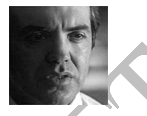
No Sherlock Holmes