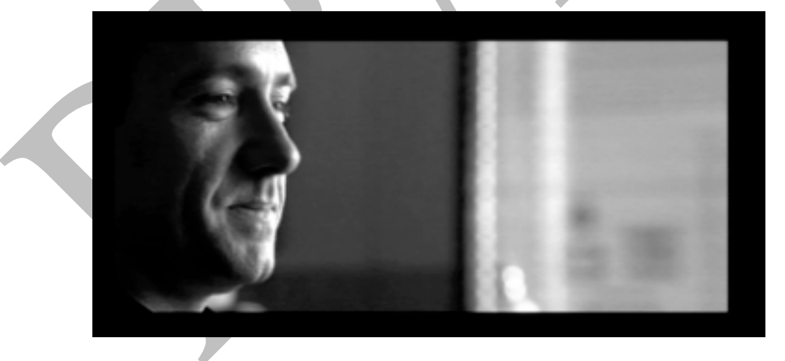
The Devil at play

The culminating montage thus reminds us of the problem, but it also hints at the solution. Why would a secretive criminal stick his neck out? He wouldn't. But the Devil might.<sup>13</sup> The Devil, who is safe from harm, might, for that very reason, be in need of distraction. K., I suggest, chooses to play his elaborate game with Kujan because that is what those who are beyond the human realm do.<sup>14</sup> They have time on their hands; they cannot die or be harmed; they temper their lassitude by dallying with mortals, sporting with them, taunting them, challenging them to battles of wits, dazzling them with their artistry.<sup>15</sup> (Every artist, as the old saw goes, needs an audience.) "How do you shoot the Devil in the back?"<sup>16</sup> "This guy is protected from up on high by the Prince of Darkness." "The greatest trick the Devil ever pulled was convincing the world he didn't exist." K., with his carefully groomed widow's peak, is not a two-bit conman; he is in fact the Devil himself.<sup>17</sup>