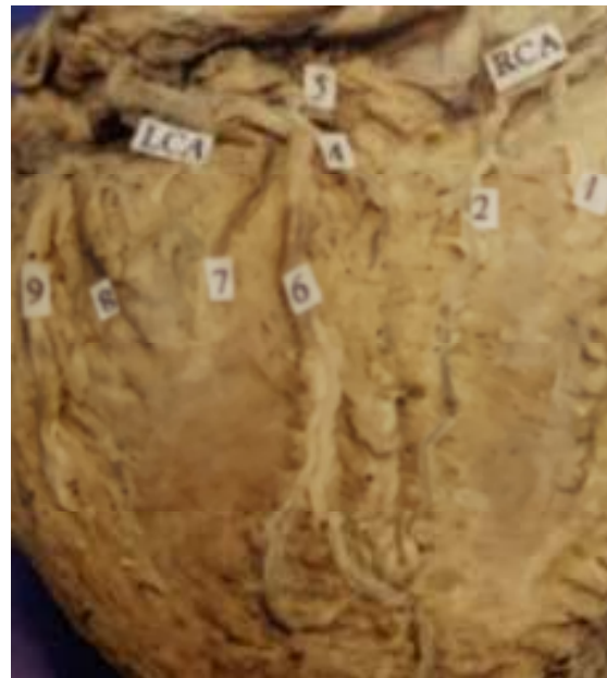
Fig.-4: Posterior Interventricular artery arose from both right (No 2) and left (No 6) coronary artery casing balanced dominance.