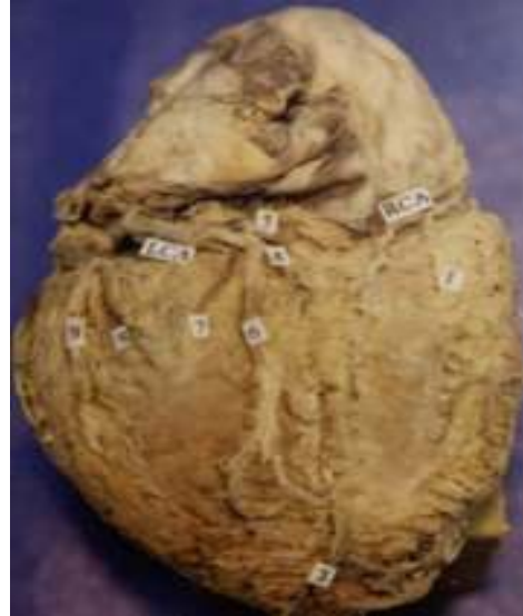
Fig.-3: Posterior Interventricular artery arose from left coronary artery (No 6) casing left dominance.