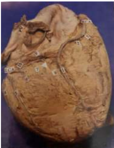
Fig.-2: Posterior Interventricular artery arose from right coronary artery (No 1) casing right dominance.