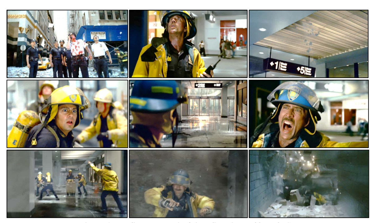
Figure 6: The first collapse in Oliver Stone's World Trade Centre

calling his men to retreat out of the building. As this happens a large sound is suddenly heard and the policemen look upwards and then around and then at each other; this entire sequence is shot in slow motion. The light starts to darken and the camera cuts between shots of lights exploding, windows shattering, debris falling, walls cracking and the policemen looking afraid. After thirty seconds of slow motion destruction, Nicholas Cage's character shouts (also in slow motion) to run for the elevator shaft. They begin to run as clouds of dust and debris sweep into the concourse; some of the men make it to the shaft and some are swept away by falling debris. The camera takes up multiple viewpoints to show each aspect of this sequence in detail and it finishes with the elevator shaft in the centre of the frame as the floor collapses and the walls fall on top of the men to bury them amid the rising dust. After the shaft caves in upon itself there is an abrupt cut to darkness and silence to mimic the unconscious states of the policemen. This sequence is sixty seconds long.