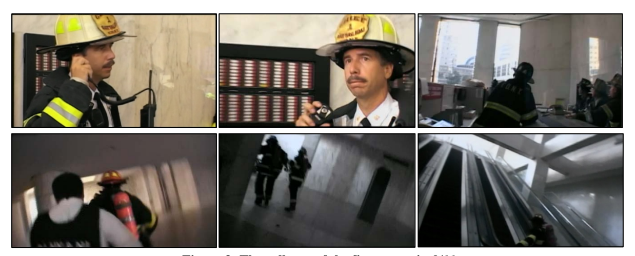
Figure 3: The collapse of the first tower in 9/11

A radio broadcast conveying a summary of the occurrence is played over a panorama of the debris engulfed Manhattan. As a viewer we see first-hand how it was experienced in great detail and then we see the encapsulated image from afar. We are then shown a short few seconds of the carnage in the streets outside; people fleeing the debris and a radio broadcast proclaiming, 'the scene is just right out of one of those films you would see in Hollywood'. This short display of recognisable footage demonstrates the sense of acting out within the repetitious use of such imagery; the encapsulation of the occurrence and its near standard communication is factual, but is not something that either allows for a reconfigured Real or that could be described as aid to the working through of this traumatic occurrence. Such repetitious communication is exactly what is implied in Baudrillard's reversed statement of the terrorism of spectacle. The spectacle of the image is almost terroristic in its distanced, unequivocal, almost excessive display of destruction. This short montage of the collapse and its effects, framed from afar, is immediately recognisable to the viewer; it contrasts 9/11's footage from the Naudets' lenses, which show the occurrence unfold from a new perspective. The contrast of these two sequences reminds the viewer of the manner in which they received their information on September 11<sup>th</sup> and how this has formed their entrenched memories from that day.