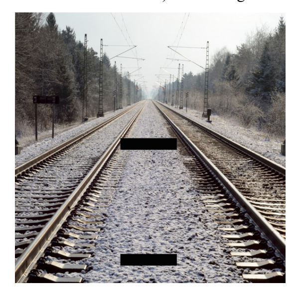
Figure 2: Ponzo Illusion

subtended by an object in the visual field and then infers using Emmert's Law a size which is to be represented in perceptual experience. Inferential mechanisms are also used to explain illusions. For example, in the Ponzo illusion illustrated in Figure 2, the black bars are the same length but the depth cues provided by the receding track generate a visual representation of the upper bar as longer than the lower.