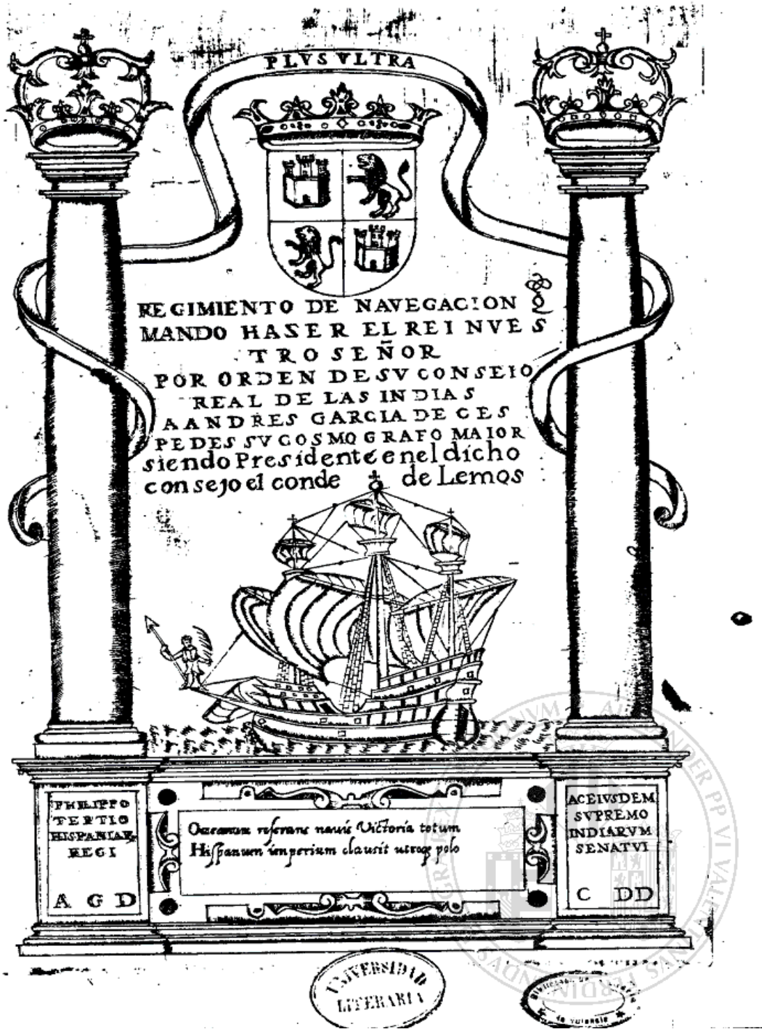
Figure 1. Title page of Regimiento de Navegación by Andrés García de Céspedes (Madrid, 1606)