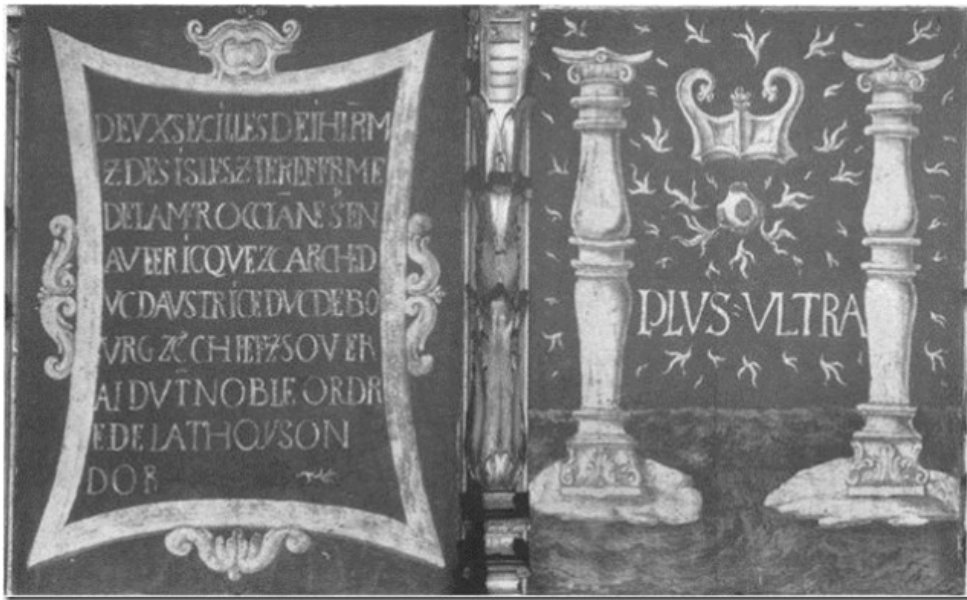
Figure 3. Device of Charles I of Spain, choir of Barcelona Cathedral, 1519

Already in 1979, British emblem scholars argued that the Instauratio Magna frontispiece “is a brilliant adaptation” of the emblem of the Emperor Charles V, invented for him by his personal physician, the Milanese humanist Luigi Marliano in 1516 (see Figure 3). [67] This emblem became worldwide famous, its weighty symbolic force rapidly spread over Europe in different heraldic and ornamental devices, [68] even in title pages of French, English and Dutch books. [69] We cannot ascertain that Bacon ever saw or was told about the engraved title of Regimiento de Navegación , but it seems indubitable that he was acquainted with the Habsburg iconography on which García de Céspedes’ title page relied. Hence, if Bacon decided to borrow the image of Hercules’ pillars for the cover of his opera magna, the model was widely available.