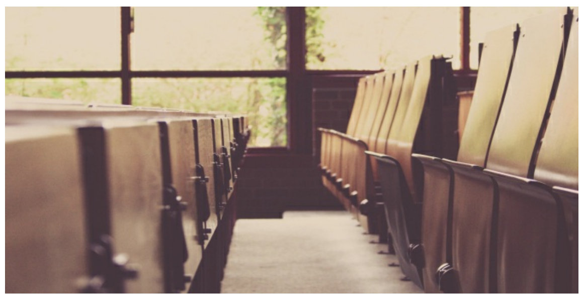
Image credit: lecture hall / university, by Markus Spiske. This work is licensed under a CC BY 2.0 license.

The second chapter offers an illustration of how to do history over the long duration by tracing writing instruction, the oldest education practice, over 4,000 years of history. The history of education starts with the history of writing, and these two have been almost indistinguishable for long stretches of time. Text is the "most important for the culture of education" (16) because education has writing at its centre, understood as a system of inscription. Passing on this system requires a lot of instruction and effort, because our brains are not naturally wired to learn how to write or to use inscriptions. Friesen reconstructs the history of education as the history of the effort to rewire the brain into learning to write and to use writing for thinking. The chapter compares ancient techniques of writing from Sumer, Jewish education and the Chinese imperial age with current writing practices. Friesen shows that writing instruction historically was standardised through repetitive exercises and dictation. Learning to write was about acquiring patterns of behaviour in designated spaces, separating pupils from the productive world and allocating for this a designated time: the time of the school. The similarity with current learning practices is striking. Friesen shows that children today "still learn writing through a set of steps with carefully sequenced arrangements of instructional methods, materials and content" (29).