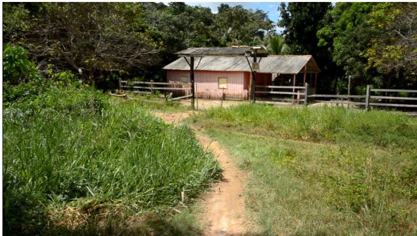
Photo 2 - Entrance of Vicinal of Portel, Pacajá (PA). Author: Cleison Nazaré, 05/2013.

However, this representation confronts with reality. The unsung heroes, transformed into faceless mass in the plans for a new space (NAHUM, 2011), have an inescapable concrete existence and, while existing, try to (re)produce from the triad - Need, Sacrifice and Promised Land - their living places.