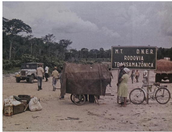
Photo 1 - Opening of the Trans-Amazonian, 1971. Source: www.exposicoesvirtuais.arquivonacional.gov.br Figure 1 - Northeastern arrival by the newly open road. Author: Oswaldo Maricato/Editora Abril. Source: VESENTINI; VLACH. Geografia Crítica , 2009.

Its construction dates back to the year 1971 and brought whole families that came from the northeast already in this period and over the years 1970 and 1980 to occupy the land and make history conceived as nonexistent. The Trans-Amazonian Project was not restricted to the region, neither to geography, as pointed out by Souza (2010 p. 7) when wrote that