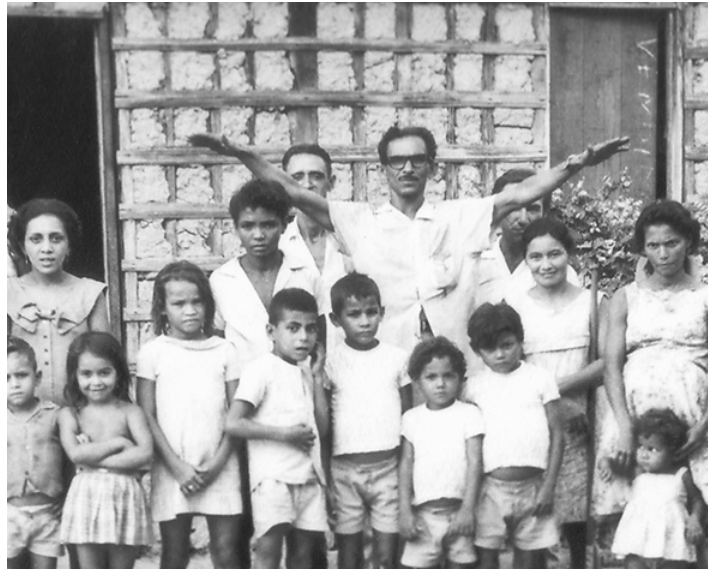
Photo 3 - Mestre Gabriel (with open arms) in Porto Velho, the 60s. Source: www.udv.org.br , 2015.

the saga of a hero, he viewed himself as a hero by the group he created. The tea, the “União do Vegetal” begins to mean the light of wisdom and the profound union with nature by those who share it, creating a new sacred movement.