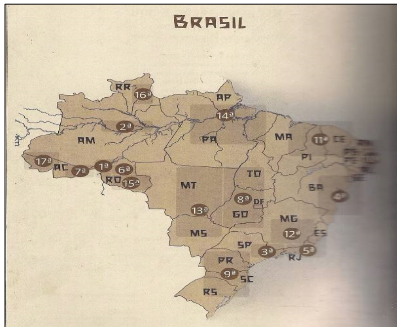
Figure 3 - Map of Brazil per Regions of UDV.

The expansion of this religious society takes from the territory meant as sacred, using material techniques to effect expansion and maintenance, present in all regions of Brazil, including abroad.