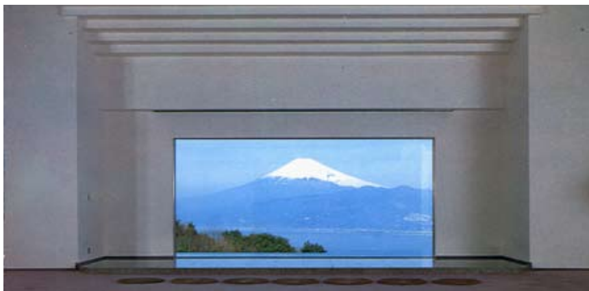
FIGURE 3 Mt. Fuji as seen through the huge glass in the Hall

peaceful place,” in your mind, so please do not cause other guests annoyance. Party and drinking are allowed only in a limited time.