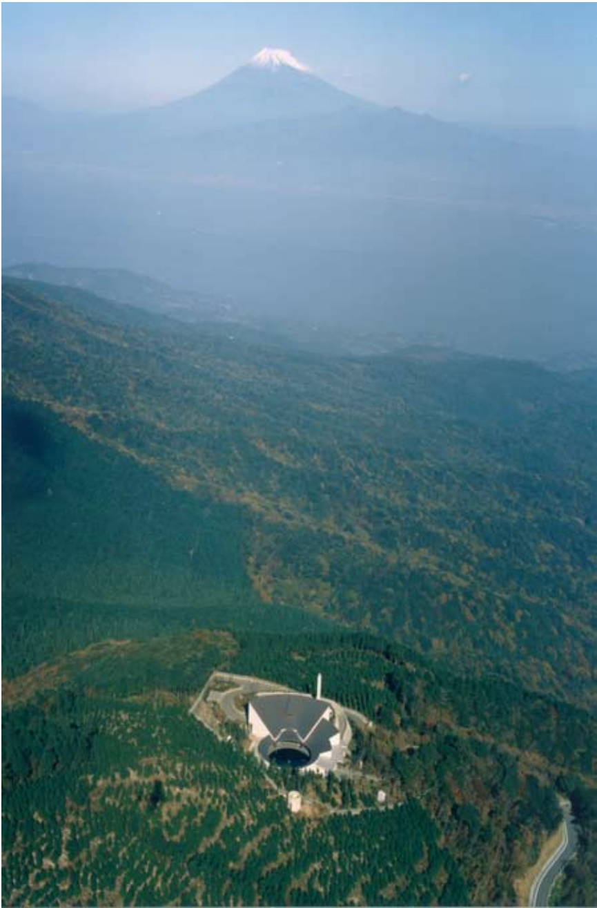
FIGURE 2 Goreisho, Suruga Bay, and Mt. Fuji