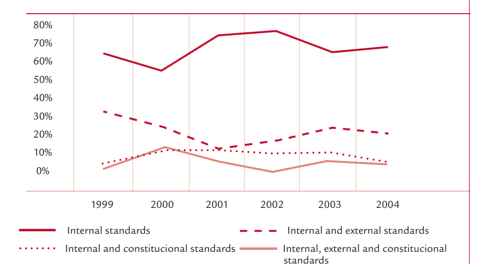
Table 4. Combinations of Groups of Standards - Changes Over Time*

*The four most common combinations.