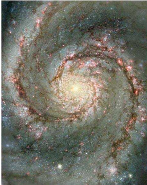
Figure 2: Hubble Space Telescope image of M51, the Whirlpool galaxy.

the interstellar medium, and the shock wave purportedly triggers compression of the interstellar medium, and the observed star formation in the spiral arms. The spiral arms therefore trace the brightest regions in the disk of a galaxy because the brightest regions are those which contain the shortlived O- and B-type stars. As Tayler states, “the most massive stars have such a short lifetime that, by the time they have ceased to be luminous, the spiral pattern has hardly changed its position. They should therefore only be found in the spiral regions. . . Stars of lower mass, such as the Sun, have a main sequence lifetime which is equal to many rotation periods of the pattern. Such stars should therefore be observed throughout the disk with no significant correlation with the present position of the spiral arms,” (1993, p145).