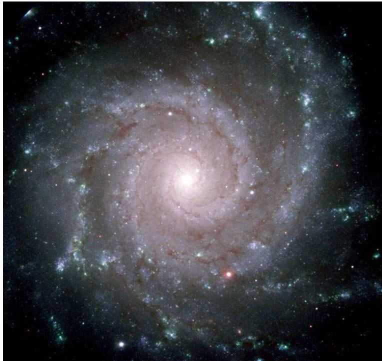
Figure 1: Spiral galaxy M74.