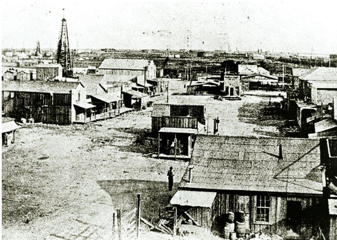
Gladys City Boomtown. 1902. Lamar University Archives.

Recognizing the need to preserve the region's rich industrial heritage and the historical significance of Spindletop, Lucas Gusher, and Gladys City, a meticulous reconstruction of the city was undertaken. Visitors to this reimagined cityscape are transported back to the heady boomtown days. They can witness the awe-inspiring spectacle of Lucas Gusher's discovery on January 10, 1901, re-enacted with a functioning replica that shoots water skyward at the same pace as the original oil gusher.