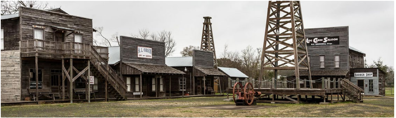
Spindletop-Gladys City Boomtown Museum. 10 Jan. 2023. Lamar University Archives.

Today, amidst growing concerns about climate change, it is critical to reassess the long-term viability of petroleum-dependent economies. Spindletop's legacy underscores our historical reliance on fossil fuels, necessitating a reflection on our shift toward renewable energy sources.