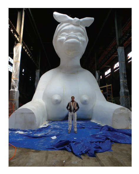
Fig. 8. Kara Walker, Sugar Baby , 2014 (polystyrene core with white sugar coating) Domino Sugar Factory, New York