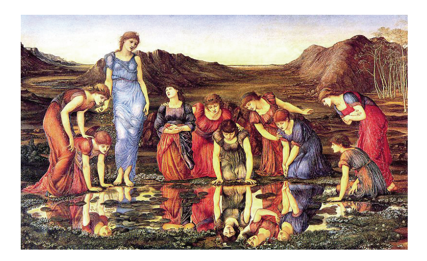
Fig. 2. Edward Burne-Jones, The Mirror of Venus , 1898 Museum Calouste Gulbenkian, Lisbon, Portugal