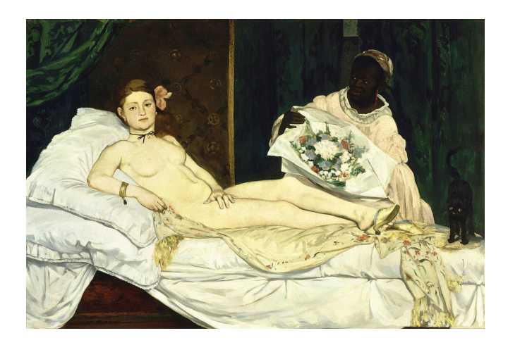
Fig. 2. Édouard Manet, Olympia , 1863 Musée d'Orsay, Paris