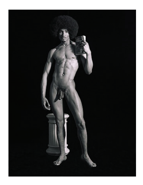
Fig. 6. Reneé Cox, David , 1994 (photography) New Museum of Contemporary Art, New York