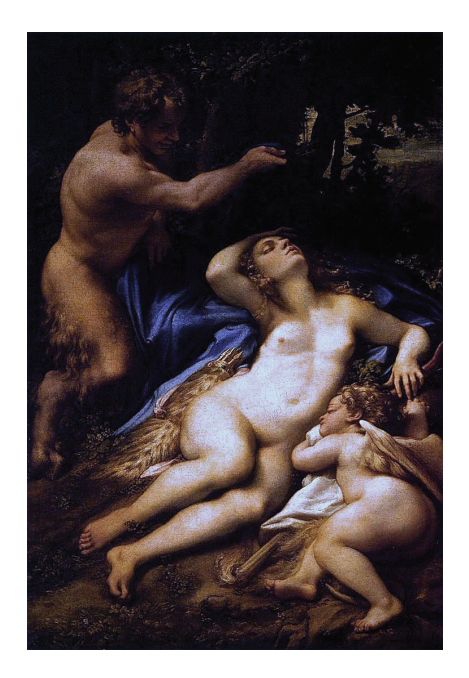
Fig. 1. Antonio da Correggio, Venus, Satyr, and Cupid , 1528 Musée du Louvre, Paris