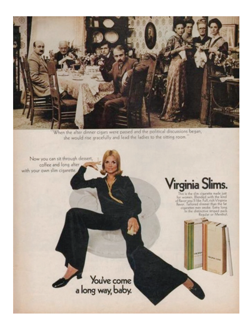
Fig. 1. 'You've come a long way, baby', Virginia Slims, 1969 Source: Flavorwire. Virginia Slims 1969 Ad , [online] http://flavorwire.com/ 183675/adman-vs-the-beatles-who-drove-60s-culture/virginiaslims