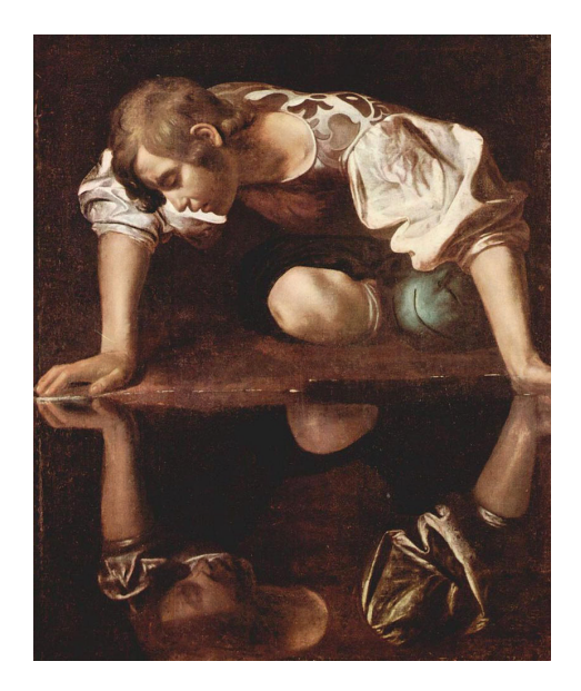
Fig. 1. Caravaggio, Narcissus , 1597–1599 Galleria Nazionale D'Arte Antica, Rome, Italy