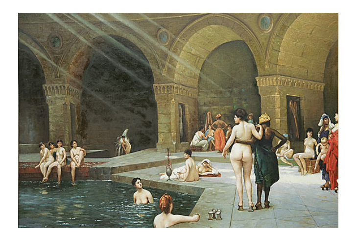
Fig. 4. Jean-Léon Gérôme, The Great Bath at Bursa Turkey , 1880–1885 Private collection