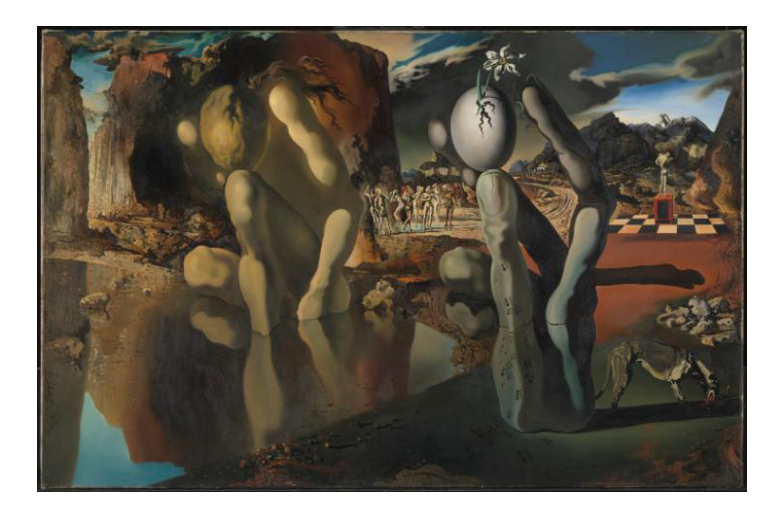
Fig. 3. Salvador Dalí, Metamorphosis of Narcissus , 1937 Tate Modern, London, United Kingdom