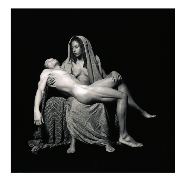
Fig. 5. Reneé Cox, Yo Mama's Pieta , 1994 (photography) New Museum of Contemporary Art, New York