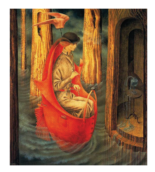
Fig. 4. Remedios Varo, Exploration of the Source of the Orinoco River , 1959