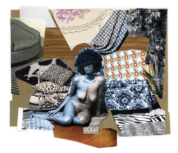
Fig. 7. Mickalene Thomas, Maya #6 , 2014 (color photograph and paper collage) Lehmann Maupin and Artists Rights Society (ARS), New York