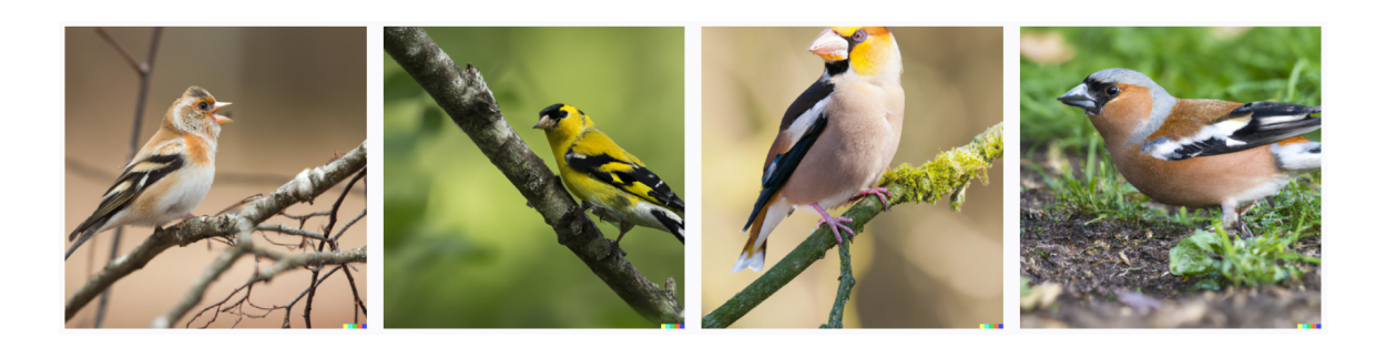
Figure 1: Sample images generated by DALL-E 2 with the prompt uccoisegeljaros.