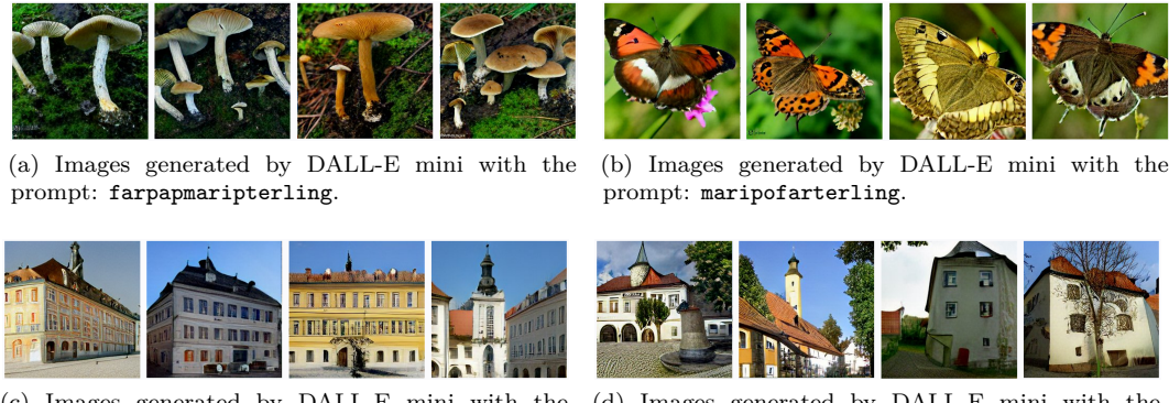
(c) Images generated by DALL-E mini with the prompt: voiscellpajaraux.