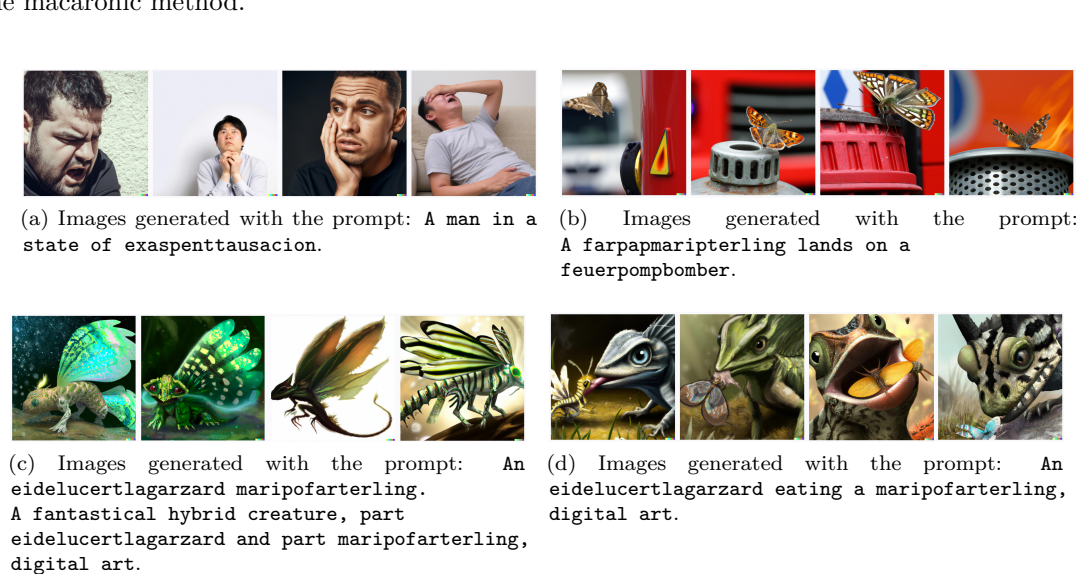
Figure 6: Examples of compositional macaronic prompting with DALL-E 2.

with the prompt An eidelucertlagarzard eating a maripofarterling without prior exposure to macaronic prompting and knowledge of the languages used for hybridization. Furthermore, compositionally complex prompts of this kind will not trigger content filters based on blacklists, despite their use of plain English words, as long as the censored concepts are adequately "encrypted" using the macaronic method.