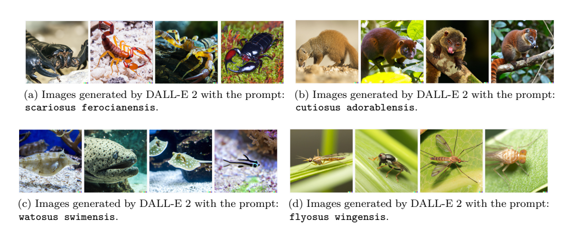
Figure 11: Examples of evocative prompting combined with lexical hybridization.

pseudolatin terminations) yields images of conventionally scary "creepy crawlies" such as scorpions; cutiosus adorablensis (combining cute and adorable with pseudolatin terminations) yields images of conventionally cute mammals; watosus swimensis (combining water and swimming with pseudolatin terminations) yields images of aquatic animals; and flyosus wingensis (combining flying and winged with pseudolatin terminations) yields images of flying insects.