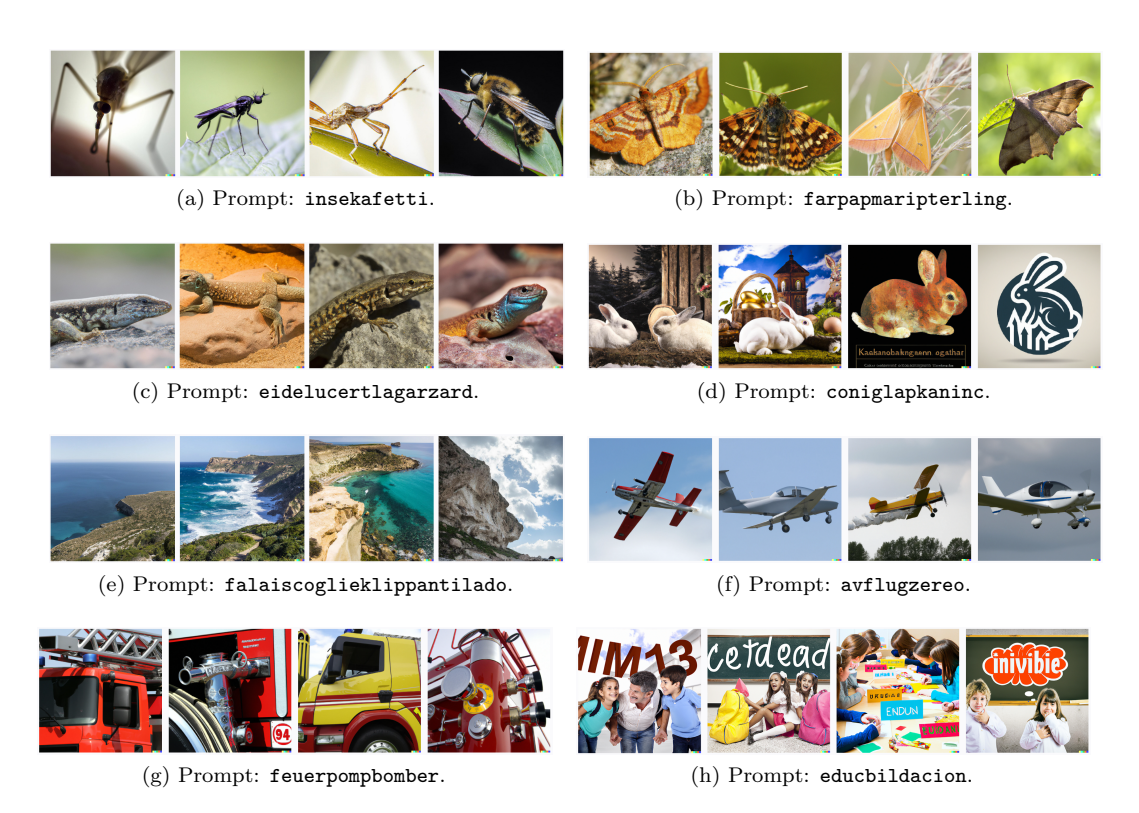
Figure 3: Additional examples of macaronic prompting with DALL-E 2.