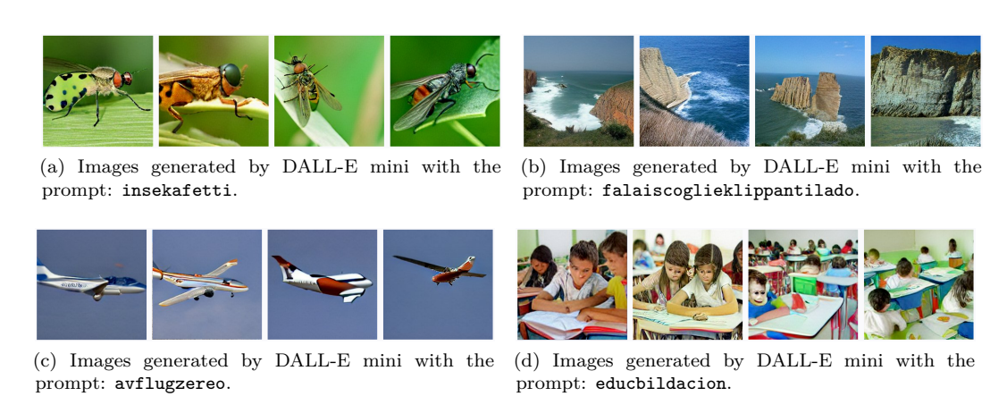
Figure 4: Examples of macaronic prompts that work across models.

on multilingual data. In fact, some macaronic prompts appear to work consistently across models, suggesting that it might be a viable approach for one-size-fits-all adversarial attacks on image generation algorithms. Fig. 4 shows some samples generated by DALL-E mini [18] with macaronic prompts that also work with DALL-E 2. It is worth noting that, despite their similar names, DALL-E 2 and DALL-E mini are fairly different. They have different architectures (notably, DALL-E mini does not use diffusion), are trained on different datasets, and use different tokenization procedures (DALL-E mini uses a BART tokenizer that may segment differently than CLIP's tokenizer). Given these differences, the fact that many macaronic prompts work on both models is noteworthy.