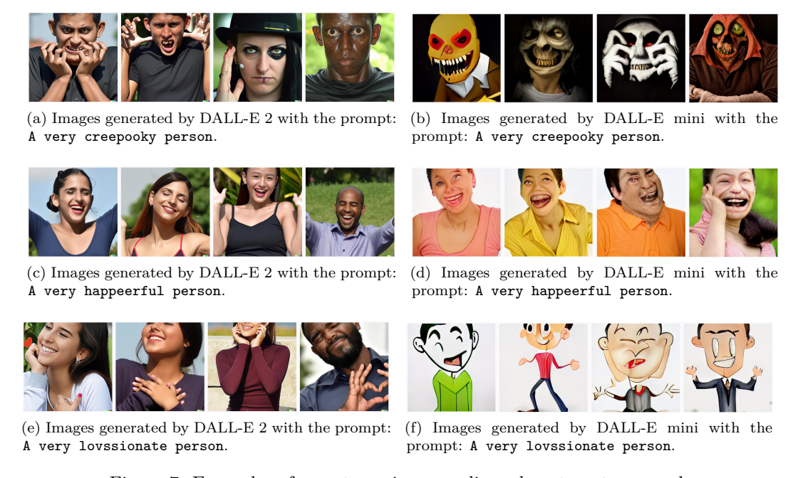
Figure 7: Examples of promtps using monolingual portmanteau words.

examples of images generated from multiple models using three invented English portmanteau words: creepooky (creepy + spooky), happeerful (happy + cheerful), and lovssionate (loving + compassionate).