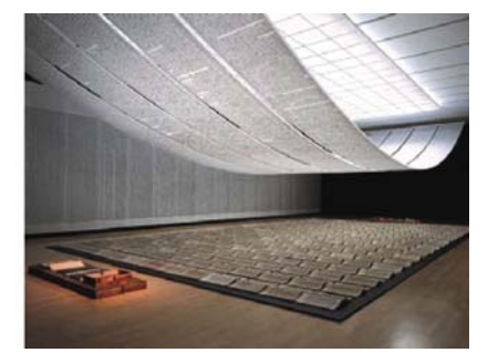
Fig. 1 Xu Bing. Book from the Sky , 1987–1991. Mixed Media Installation. The National Gallery of Canada, Ottawa