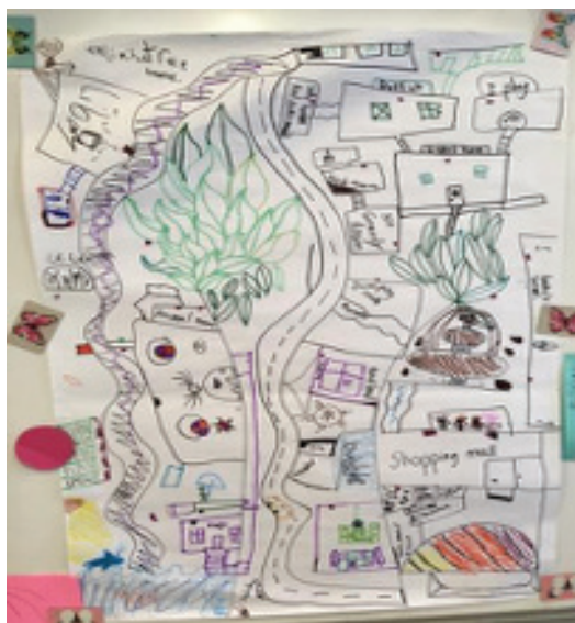
Figure 1. The Unlimited Tree-house – how to make the school better (Year 5 students)

In the Ainslie pilot, we worked with a group who responded to the question “How can we make the school better?” with a suggestion of “Fanta in the bubblers!”. This led to a rapid series of suggestions, including a pool, a foampit, KFC in the canteen. As facilitators, we initially considered how we could ‘moderate’ these responses and get the kids to be more “sensible”. But we noted that the group, who had struggled to attend to some other parts of the class, became very animated during this exercise. We began to listen to their suggestions and encouraged them to explore them as they wished. We suggested that they use art to express their ideas, and they created an Unlimited Tree-house, encompassing all their “crazy” ideas in a wonderfully creative drawing (Figure. 1).