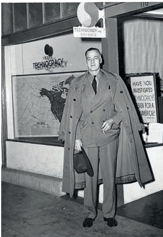
The engineer Howard Scott, who was the leader and founder of the technocracy movement.