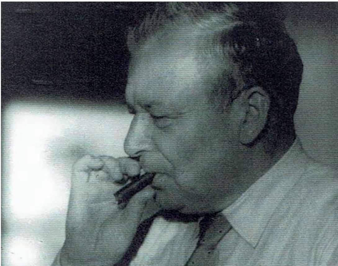
Hermann Schmidt, the founder of cybernetics in Germany.

masses, and affects. The political task par excellence becomes the direct or indirect creation of order from noise, whereby the state's goal is reduced to its mere systematic survival – what Habermas termed, in a more critical vein, equivalent to 'the biological base of survival at any cost, that is, ultrastability.' This term 'ultrastability', popularized by Ross W. Ashby in the early 1940s, is derived from the mechanisms of a classic homeostat, a device that reacts to external signals with the aim of self-regulating through constant feedback, thus reaching constant, stable states. More systematically, ultrastability can be defined as the capacity of a system to adapt smoothly to unpredicted changes by reducing noise. Early political cyberneticist Eberhard Lang went so far as to think of the general will as ultimately and solely concerned with the 'absence of disturbances' – a notion that seems reminiscent of Khanna's aim to provide the greatest efficiency of a nation's people at any cost.