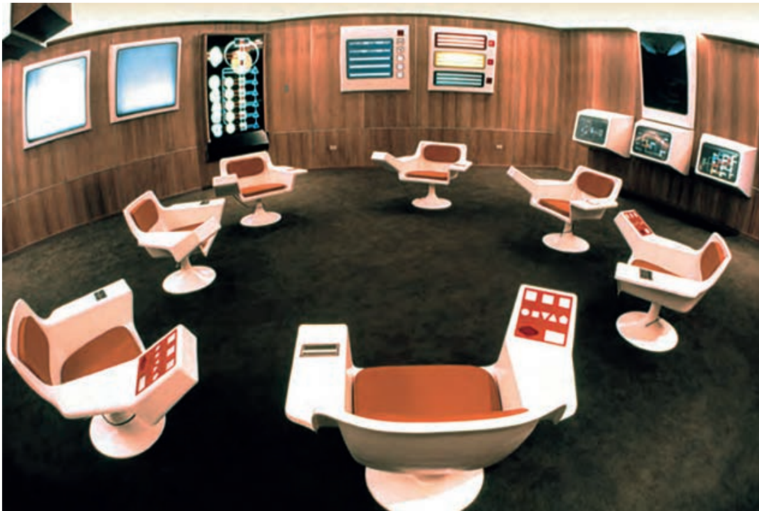
Cybersyn operations room. Source: unknown.

which date back to the 1960s. We will explore how they implicitly rearticulate early visions of cybernetic politics in their insistence on the vitality of feedback structures, in allegedly blending hierarchy with tenets of decentralization, in shifting the focus from the individual to the interrelations between humans, including the social fabric encompassing them and, most importantly, in how far this might raise problems. This rather theoretical perspective will allow us to examine the extent to which such neo-cybernetic concepts promote a rather reduced vision of the political, or politics as such. Current approaches to 'smart' states or cities and their corresponding models of governance mark not an entire automation of politics, but at least in certain respects do show a pragmatic actualization of cybernetic visions of the state, against the background of surveillance capitalism. As such, theoretical dispositifs that have emerged from early ideas of cybernetic politics are still marking certain effects.