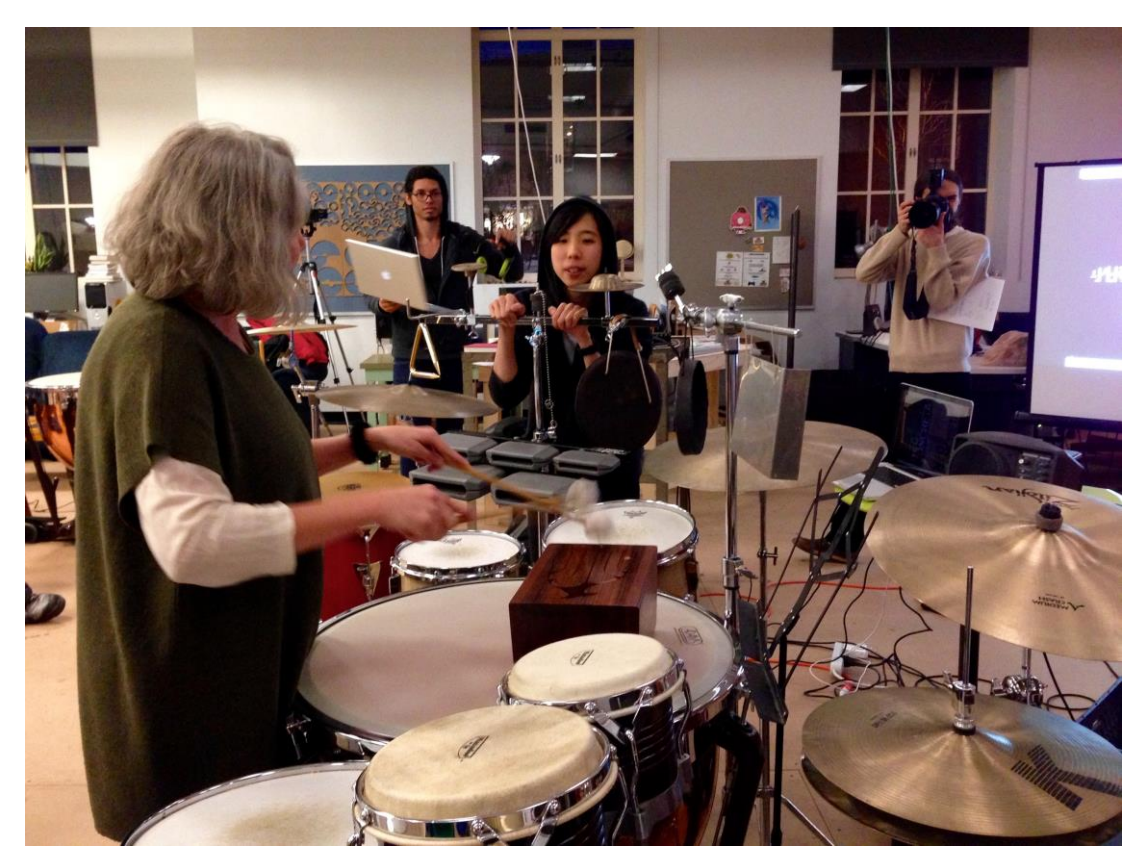
Studio Lab workshop in preparation to the Playing the Archive performance, February, 2013

In this performance, Schulkowsky and Baron read the graphic patters of the eight pages of the Neoconcrete manifesto as a music score, assigning different sounds and rhythms to headlines, text columns, concrete poems, and photographs. And also by interpreting the white space of the pages as pauses. More than fifty years after its publication, we heard the rhythms of this remarkable work, which I continue to analyze.