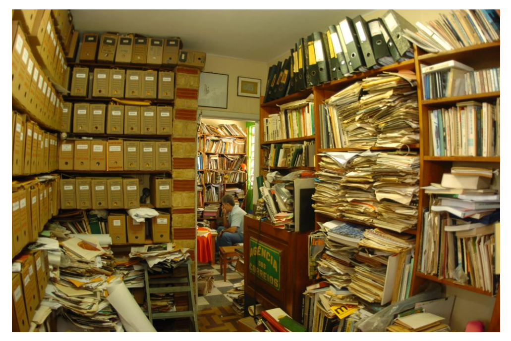
Paulo Bruscky's archives in the Torreão neighborhood, Recife, Brazil, 2004.