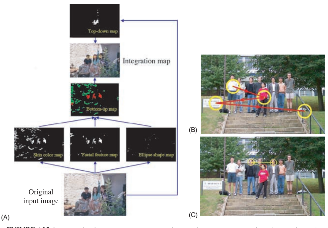
FIGURE 105.1 Example of interactive processing with natural images containing faces (Lee et al., 2003). The model (A) allocates focus of attention to possible target locations. The more task-relevant the target location with respect to the cue, the more likely the location is selected early in the attentional trajectory. Results from bottom-up WTA attention (B) are contrasted to scanpaths from graded interactive top-down attention processing (C).

CHAPTER 105. ATTENTION ARCHITECTURES FOR MACHINE VISION AND MOBILE ROBOTS