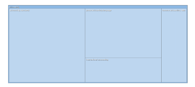
Figure 4. Nodes compared by number of coding documents for accounting

In the next figures, we illustrated the grouping of several concepts.