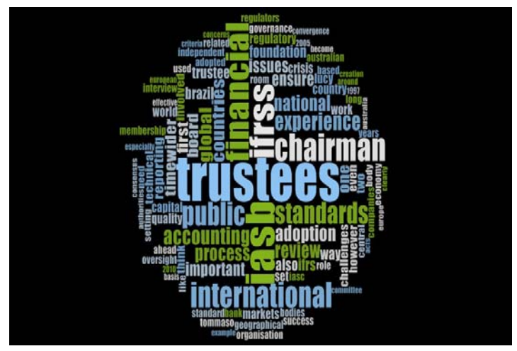
Figure 1. World cloud of the most frequent words from the three analyzed interviews.