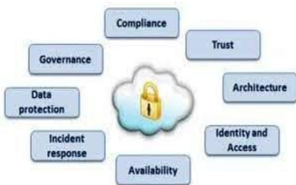
Fig.1: Security Problems in Cloud Computing Environment