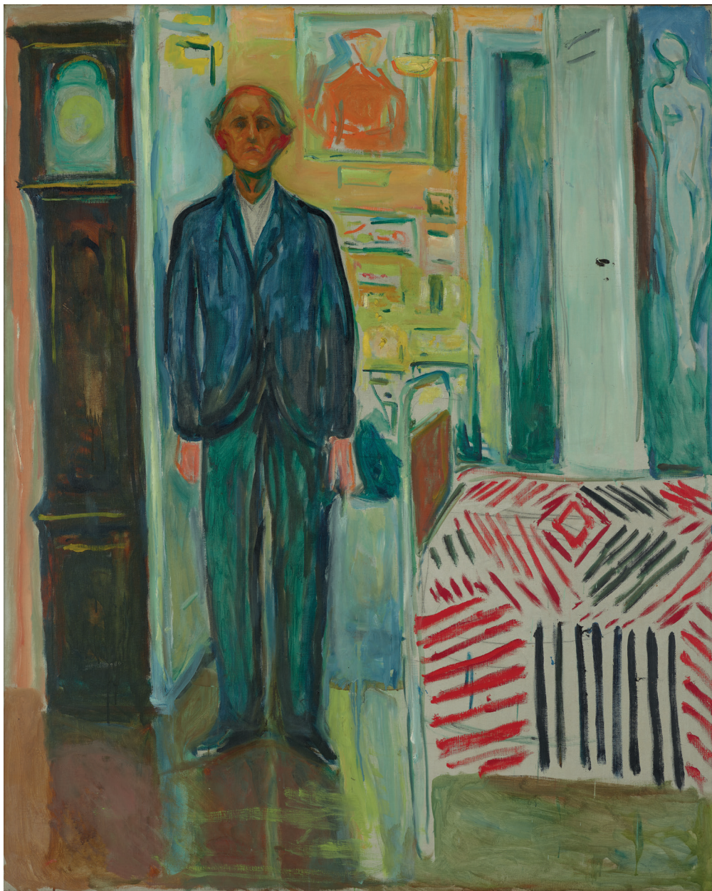
Fig. 8. Edvard Munch, Self-Portrait between the Clock and the Bed , 1940–43, oil on canvas, 120.5 x 149.5 cm. Munch Museum, Oslo.