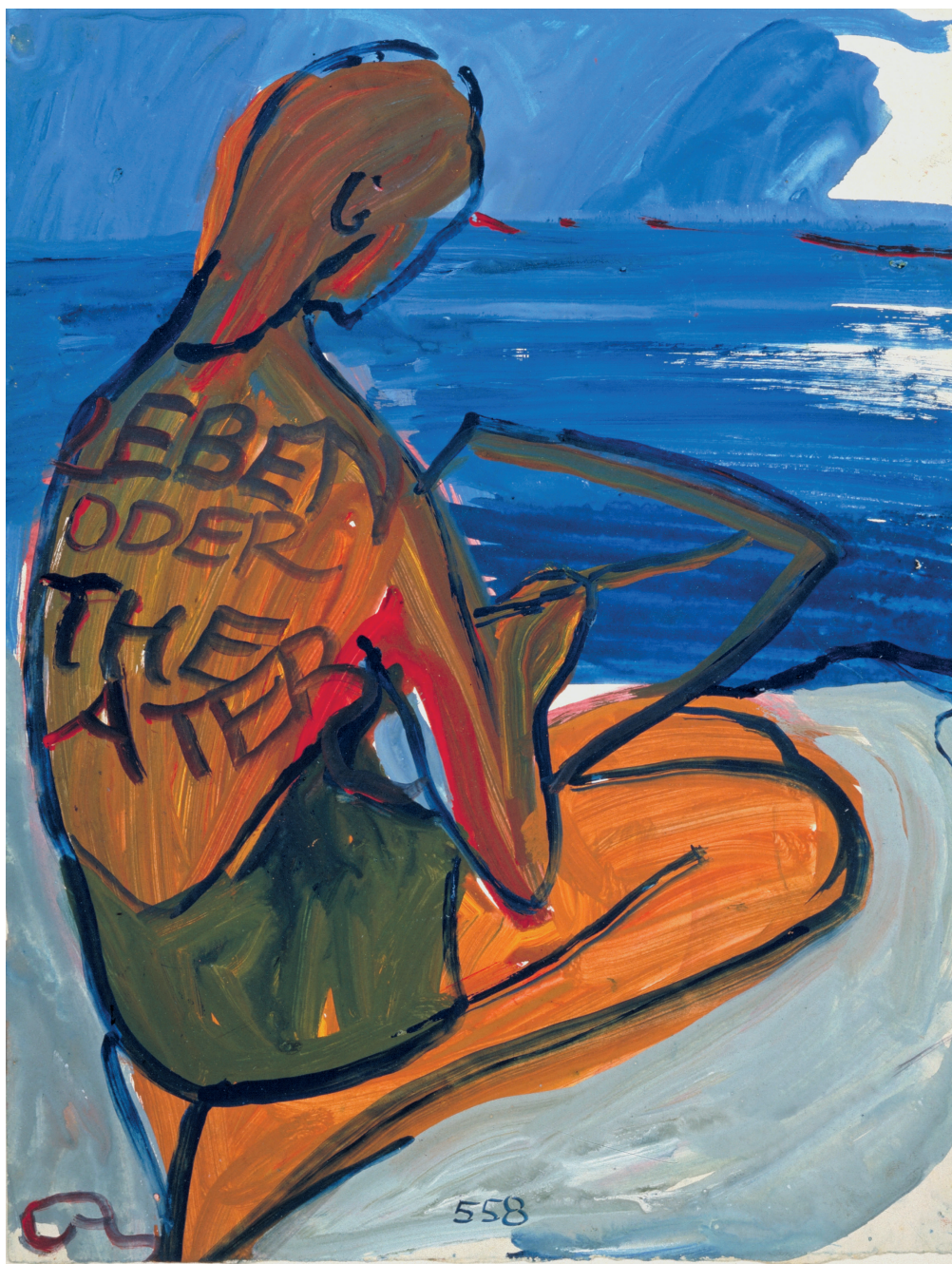
Fig. 1. CS [Charlotte Salomon], The Final Painting: CS Beginning to Paint (painting no. 558, JHM 4925). Leben? oder Theater? , 1941–42, gouache on paper, 25 x 32.5 cm. Jewish Historical Museum/Charlotte Salomon Foundation, Amsterdam.