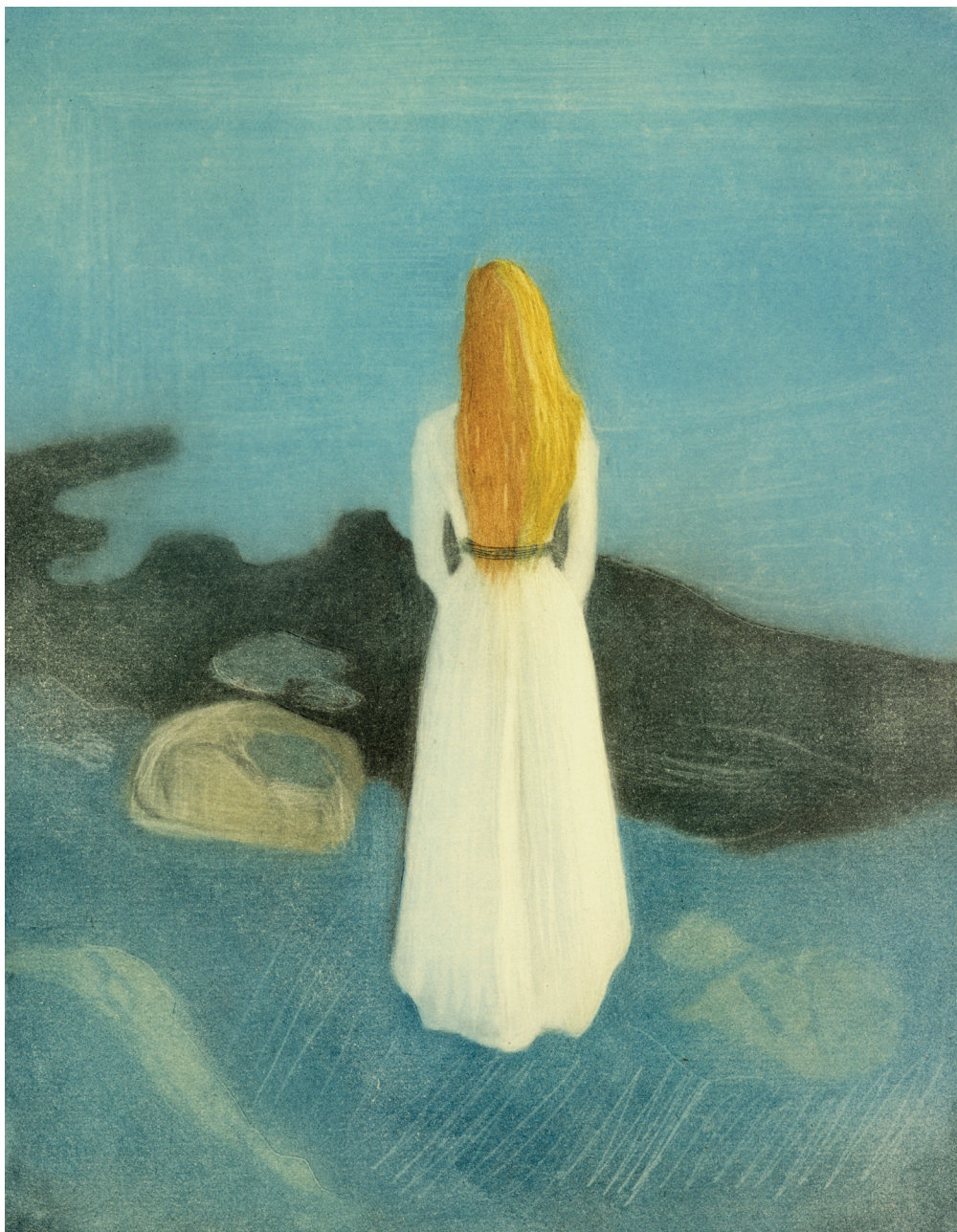
Fig. 2. Edvard Munch, Young Girl on a Jetty , 1896, coloured etching and scraped aquatint, 219 x 288 cm. Munch Museum, Oslo.