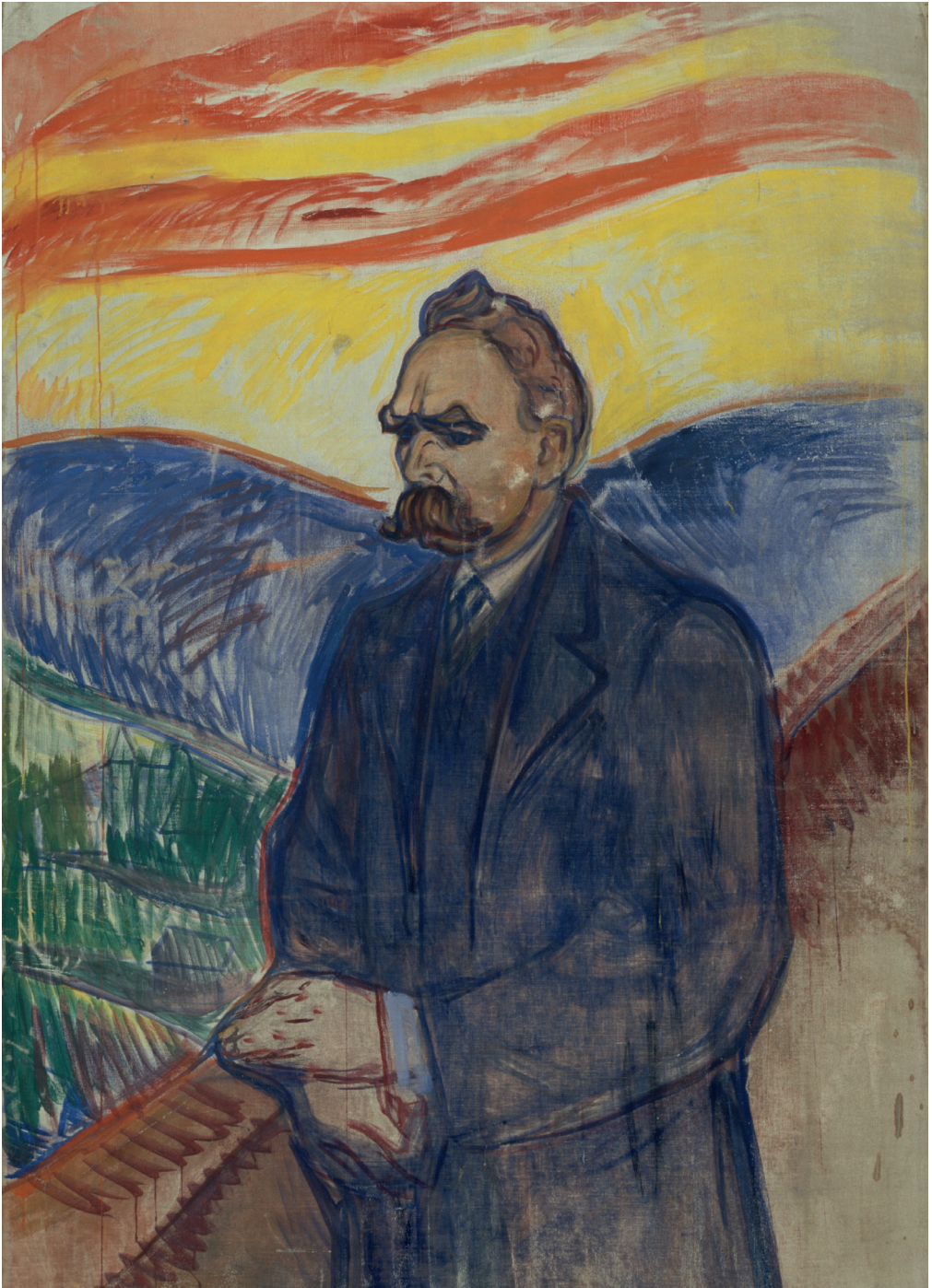
Fig. 7. Edvard Munch, Portrait of German Philosopher Friedrich Nietzsche , 1906, oil on canvas, 201 x 160 cm. Munch Museum, Oslo.