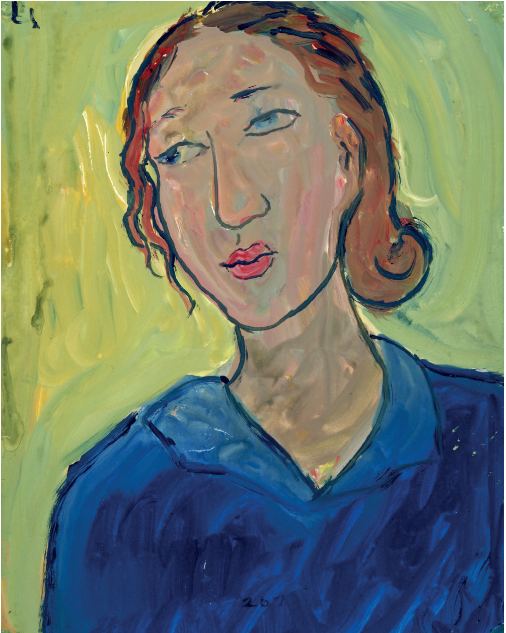
Fig. 5. CS [Charlotte Salomon], Jealous Charlotte (main part painting, no. 261, JHM 4639), Leben? oder Theater? , 1941–42, gouache on paper, 25 x 32.5 cm. Jewish Historical Museum/Charlotte Salomon Foundation, Amsterdam. The overlay says: “Charlotte is not sure of her emotions. Is it jealousy or something else growing within her where her love is concerned?”