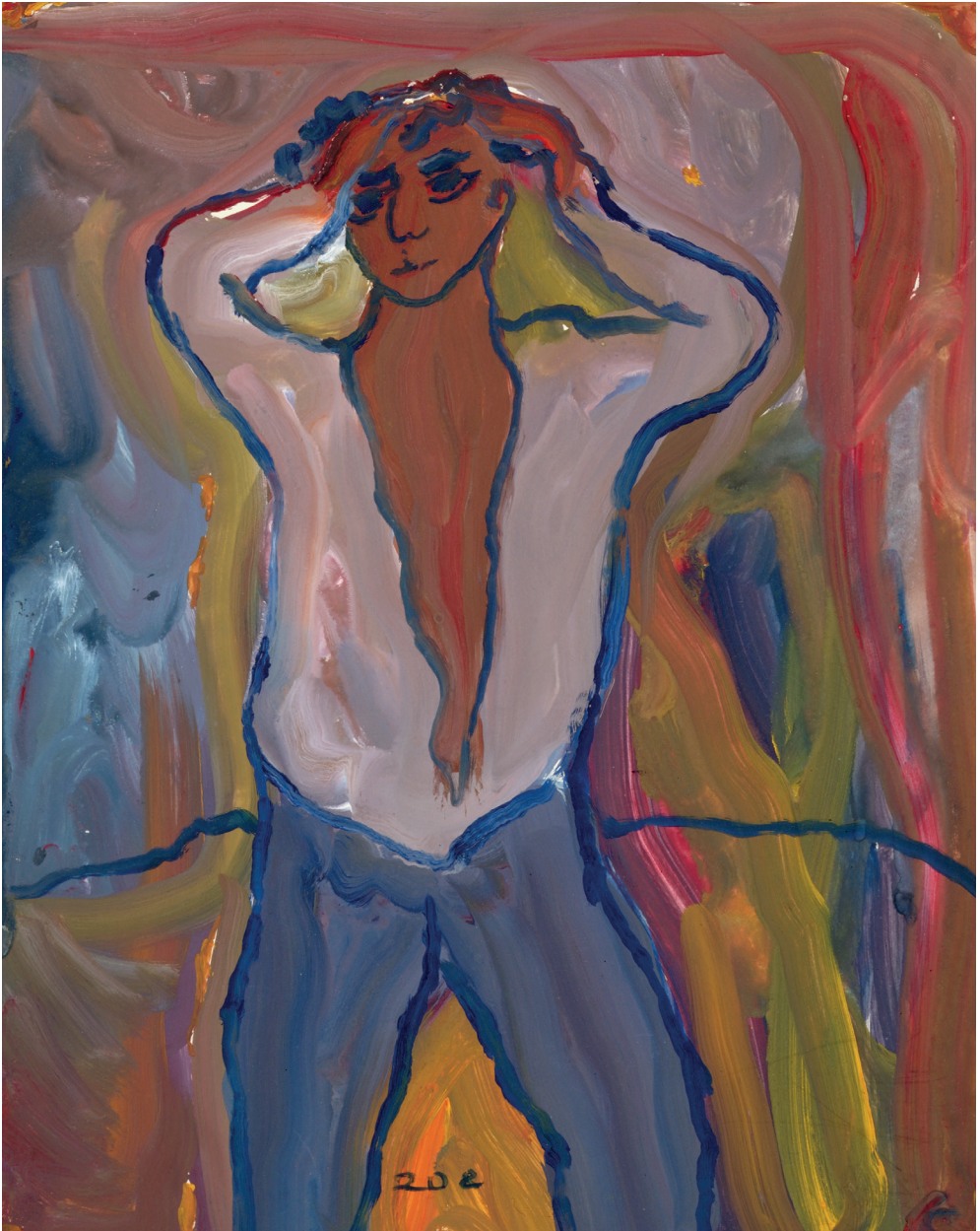
Fig. 3. CS [Charlotte Salomon], Amadeus Daberlohn after Listening to Paulinka Bimbam Singing Gluck (main part painting, no. 208, JHM 4587), Leben? oder Theater? , 1941–42, gouache on paper, 25 x 32.5 cm. Jewish Historical Museum/Charlotte Salomon Foundation, Amsterdam. The overlay says: “The blood courses hotly through his veins.”