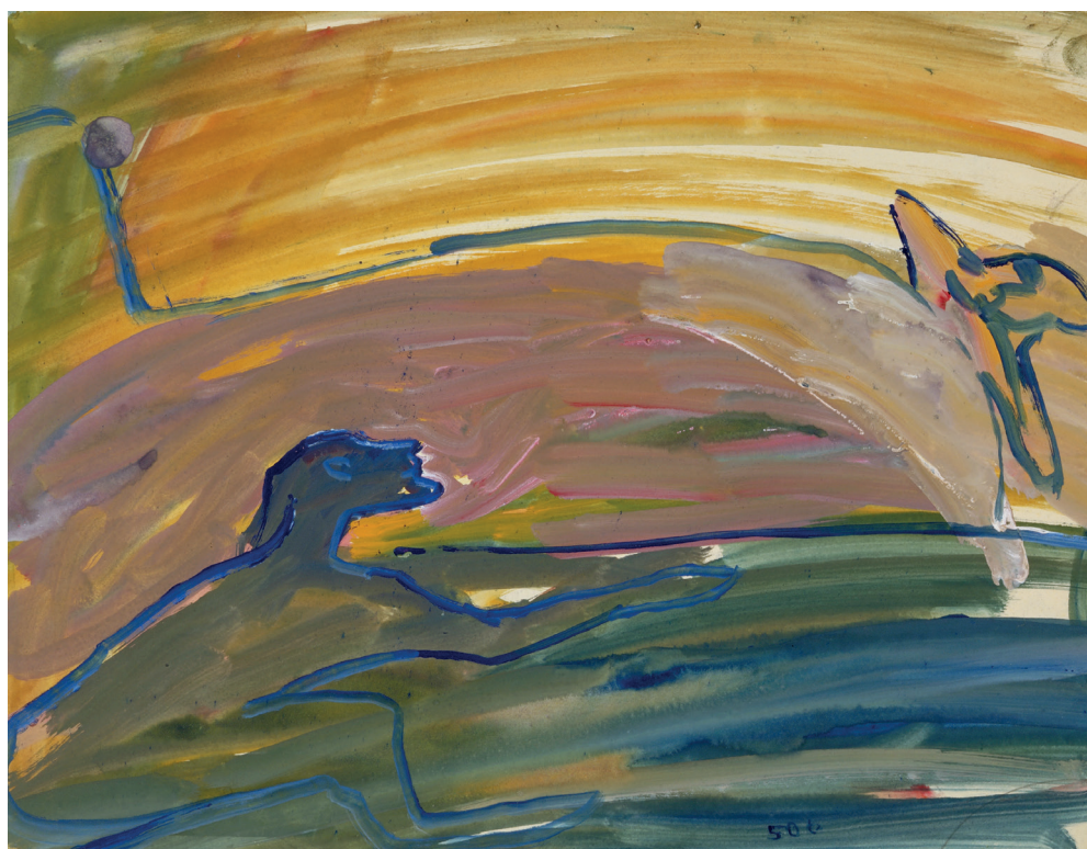
Fig. 6. CS [Charlotte Salomon], The Night Struggle (epilogue painting, no. 506, JHM 4884), Leben? oder Theater? , 1941–42, gouache on paper, 25 x 32.5 cm. Jewish Historical Museum/Charlotte Salomon Foundation, Amsterdam.