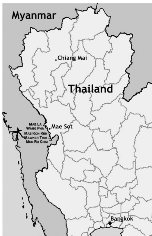
Figure 1. Map of the location of the SMRU office in Mae Sot, Thailand and the SMRU clinics along the Thai–Myanmar border.

Case study methodology was selected because it enables exploration of how or why a complex social phenomena works and can bring out important contextual