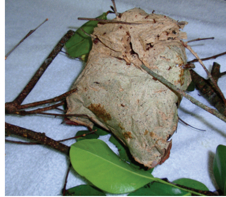
FIGURE 4: The silk nest of the weaver ant host Camponotus sp. aff. textor .

Only very limited information is available on the habitat preferences and host ant specificity of microdontines [13, 33]. As already stated, larvae are tolerated by ants, and several studies on their interaction with ants have been performed (e.g., [16]), but interactions of adults and ants have rarely been reported. Microdontine larvae migrate to the superficial part of the ant nest (near the exit) when about to pupate [16], and adults are thought to emerge early in the morning and to exit the nest unnoticed by ants. In the case of Microdon major (Andries), larvae were found inside the ant brood chambers of Formica lemani Bondroit and F. fusca Linnaeus, while pupal cases were found closer to the outer nest surface. Microdon larvae showed a clear preference for remaining among the part of the nest containing wooden