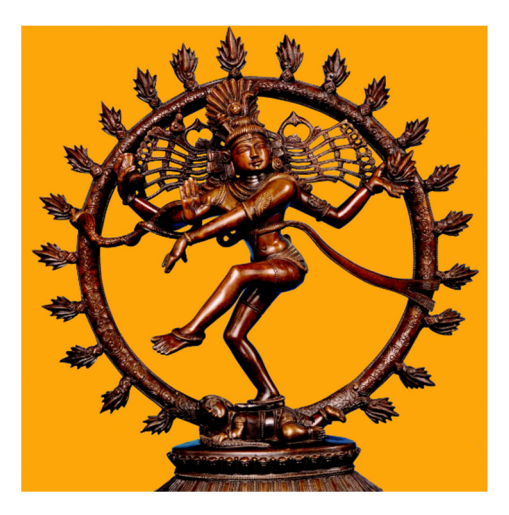
Figure 6. Classically, Śiva is depicted as the Lord of Dance, Naṭarāja, who experiences from a state of flux. In this classic depiction he is seen dancing on a demon.

significant. Western interpretation recasts propositions about these various values and norms as free-standing propositional attitudes in need of support.