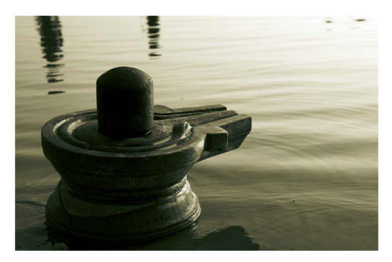
Figure 4. Depicted here is the classic Śiva Linga (phallus), where Śiva, the ideal experiencer, is within and emerging from the experience of the yoni (vulva) that is Śakti.

Śiva (see Figures 4–6), depicted as the ideal experiencing subject, and his consort Śakti (who is depicted as the full range of his emotional experiences, seen in Figure 7), are associated with teleological ethical theories, such as Kāśmīrī Śivism, or Vaiśeşika.