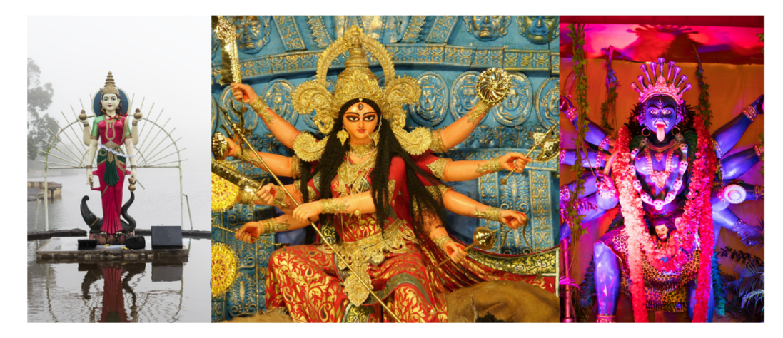
Figure 7. Here we see three expressions of Śakti, Śiva's consort. On the left we have Pārvatī (picture by Robertobinetti70, Canva ), who looks very much like Lakṣmī: attractive. Then in the middle we have Durgā (picture by Pabitra Chakraborty, Canva ), who is attractive but also fierce, displaying various weapons. On the right we have Kālī (picture by anonymous, Canva ), who is outraged over the evil she destroys.

Figure 6. Classically, Śiva is depicted as the Lord of Dance, Naṭarāja, who experiences from a state of flux. In this classic depiction he is seen dancing on a demon (picture by Lathish, Canva ).