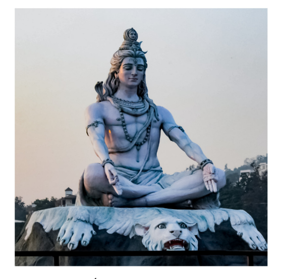
Figure 5. Here Śiva as the ideal experiencer is seated in meditation. He embodies the virtues of the ideal experiencer, unphased by turbulent events. Also, Śiva brings about good outcomes by way of meditative experiencing. For instance, the space around him in meditation is serene. Those who awaken Śiva from meditation are said to be burnt by a flame that originates from his third eye.

Figure 4. Depicted here is the classic Śiva Linga (phallus), where Śiva, the ideal experiencer, is within and emerging from the experience of the yoni (vulva) that is Śakti.