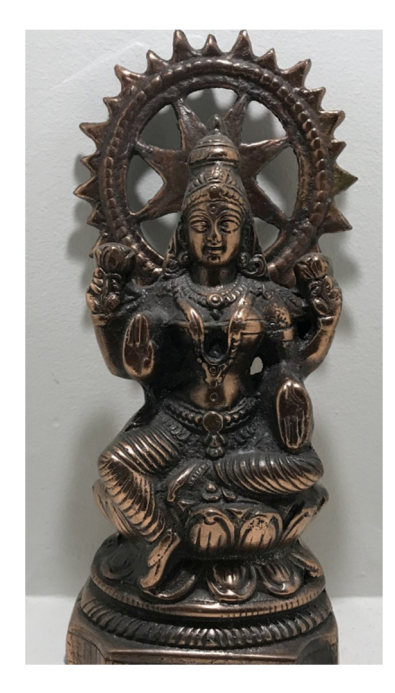
Figure 2. Here Lakṣmī who is also Padma (the Lotus) is sitting on herself. She is hence governing herself, and inspecting herself (as Lotuses she holds up). She is the yogic practice of svādhyāya : self-study, self-determination. She also embodies many other ideals of Yoga, including: svarūpevasthānam /"abiding in one's form" (YS I.3), svarūpa-pratisthā /"standing on one's form" (YS IV.34), and more literally sva-svāmī /"own master" (YS II.22) (picture by author).