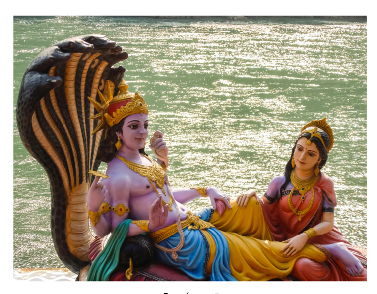
Figure 3. This is a picture of Ādi Śeṣa ( Iśvara praṇidhāna ) holding and being devoted to Viṣṇu ( tapas ) and Lakṣmī ( svādhyāya ), described as the essential practice of Yoga (YS II.1) floating on top of waves (YS I. I.2-3). Lakṣmī, svādhyāya , is also depicted here as forming a bond with her chosen ideal, as per Yoga Sūtra II.44 depiction of svādhyāya.

Figure 2. Here Lakṣmī who is also Padma (the Lotus) is sitting on herself. She is hence governing herself, and inspecting herself (as Lotuses she holds up). She is the yogic practice of svādhyāya : self-study, self-determination. She also embodies many other ideals of Yoga, including: svarūpevasthānam /"abiding in one's form" (YS I.3), svarūpa-pratisthā /"standing on one's form" (YS IV.34), and more literally sva-svāmī /"own master" (YS II.22).