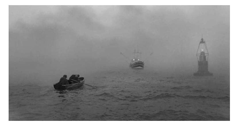
Figure 7.1 The ending of Children of Men : a rowing-boat lifeboat containing the first of a future generation encounters, through the mist, the larger lifeboat, the 'Tomorrow'. Children of Men , dir. Alfonso Cuarón © Universal Pictures 2006. All rights reserved.

matter into the light. The challenge that we need to seek to rise to, as I have said, is to produce lifeboats that are not unethical. Let's aim to build lifeboats that are good – not just at keeping afloat, but actually good, decent, enough.