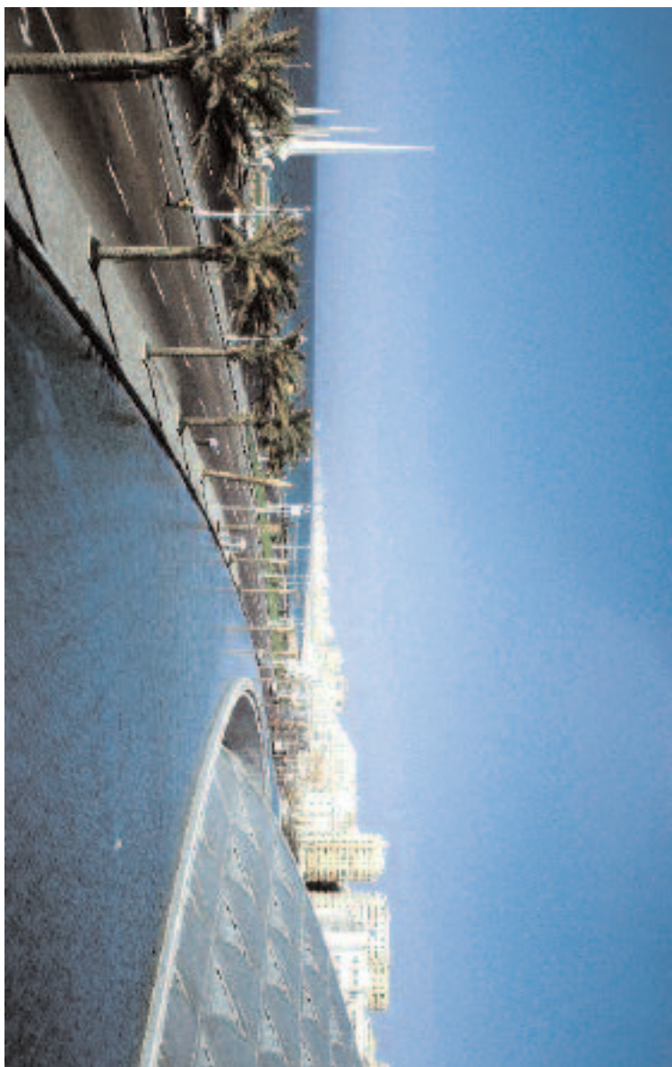
Fig. 2. Alexandria, the White City (Photo: Michael Haag © 2004).