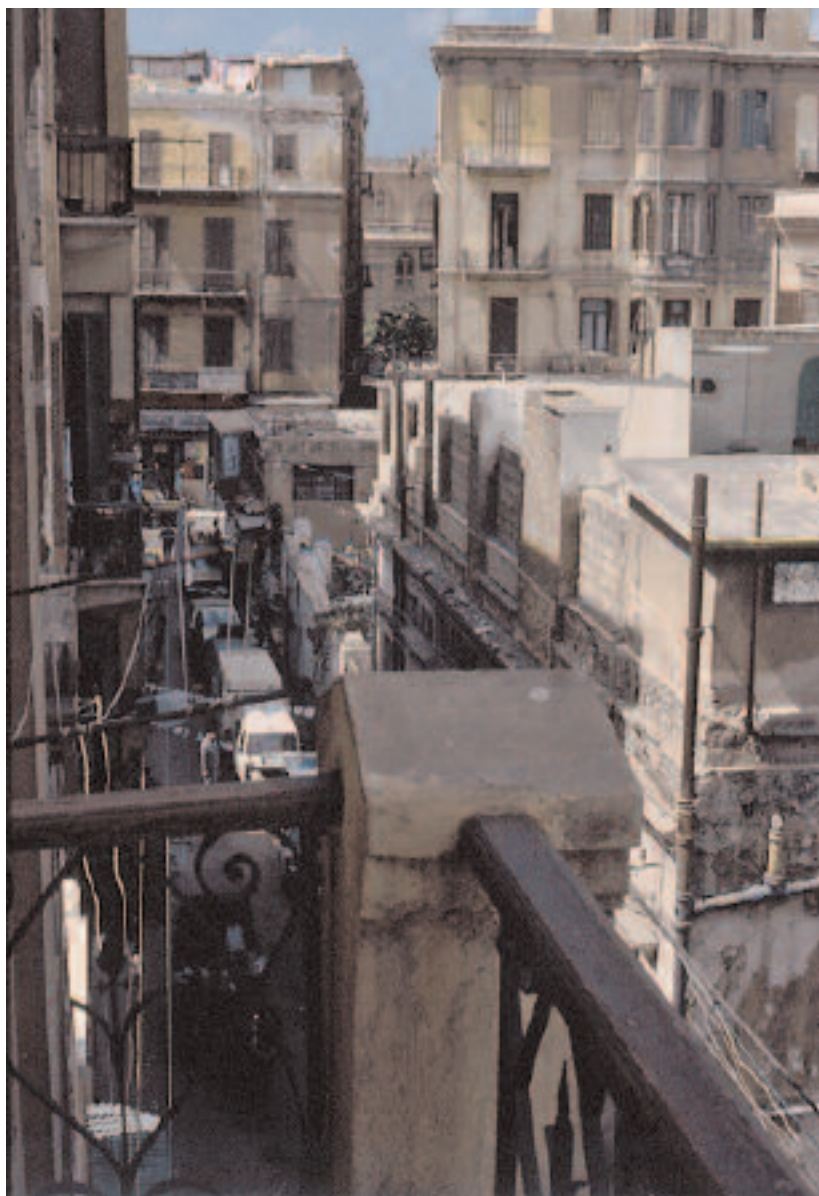
Fig. 1. Rue Lepsius, from Cavafy's balcony.