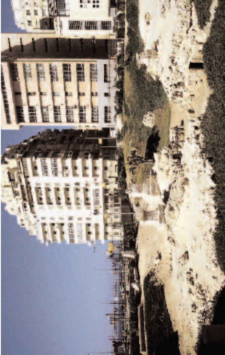
Fig. 3. Chatby necropolis.