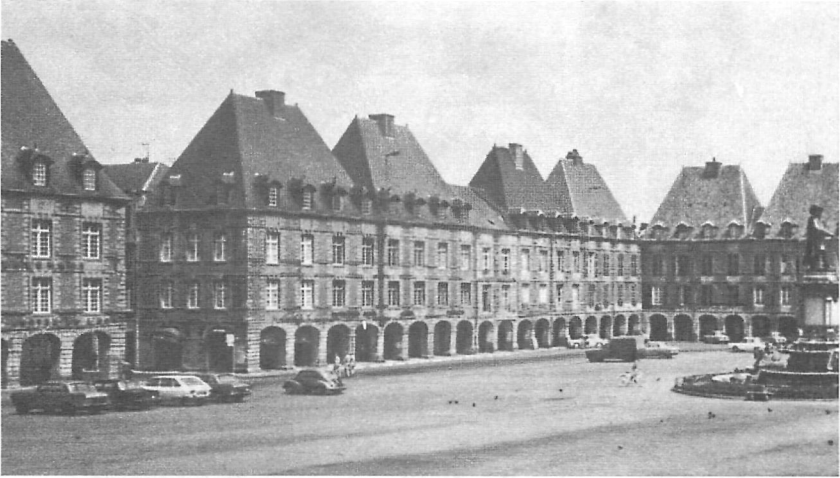
Plate 1 Place Ducale, Charleville.