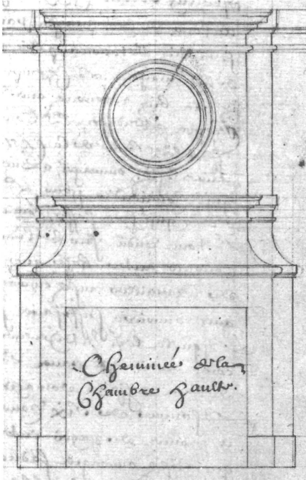
Plate 6 Mantel for 'La Maison Blanche,' Sillery, 1679. Drawn by Claude Baillif. (Archives nationales du Québec, fonds de Romain Becquet, contrat de 1 fév. 1679)