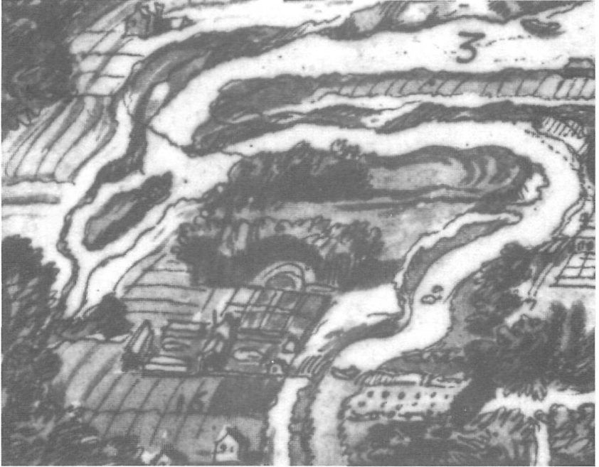
Plate 5 L'entrée de la Rivière de St-Laurent, et la ville de Québec dans le Canada. Anon. Circa 1690. Detail showing 'Les Islets,' seigneurie of Jean Talon. (National Archives of Canada, NMC 5237; original held by Bibliothèque nationale, Dépôt des cartes et plans de la Marine, Service hydrographique, Paris)