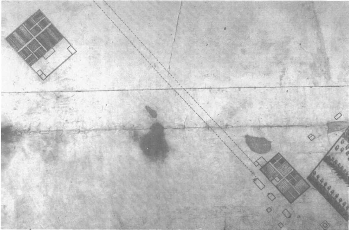
Plate 4 La Ville haute et basses de Quebec en la Nouvelle France, 1670. Anon. Detail showing 'La Cardonnière.'