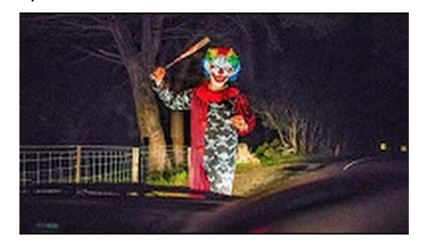
Figure 1. Clown sighting: opening fissures in striated space.

Theorizing or imagining cultural globalization begins where discursive articulations of cultural hybridity end. Cultural hybridity gained momentum amidst academic discussions about 'glocalization' that spawned the infamous dictum 'think global, act local', a managerial maxim that became entrenched ever since Levitt's Globalization of Markets (1983). The problematization of 'glocalization' was triggered by questioning the notion of 'local' in the first place. The transpiring of research streams such as cultural geography and place branding afforded to destabilize, retrajectorize and reterritorialize the meaning of 'locale' by critically questioning the overdetermination of cultural/experienced space by physical place. The concept of hybridity may be said to be if not outmoded, at least in recession, given that one of its fundamental assumptions is predicated upon a conceptualization of culture within a geographically demarcated territory. By the same token, culture has been dislodged from the province of the nation/state, while the latter is being increasingly approached as a construct that seeks to contain cultural diversity by evoking a phantasmatic dominant culture as the ideological correlate of an imaginary community (Anderson, 1983; Wodak et al., 1999), either within a state's boundaries or across geographical regions. Such antiquated ideologemes have been confronted with clown sightings<sup>1</sup> that mark events of carnivalegsue respacing of territorialized space.