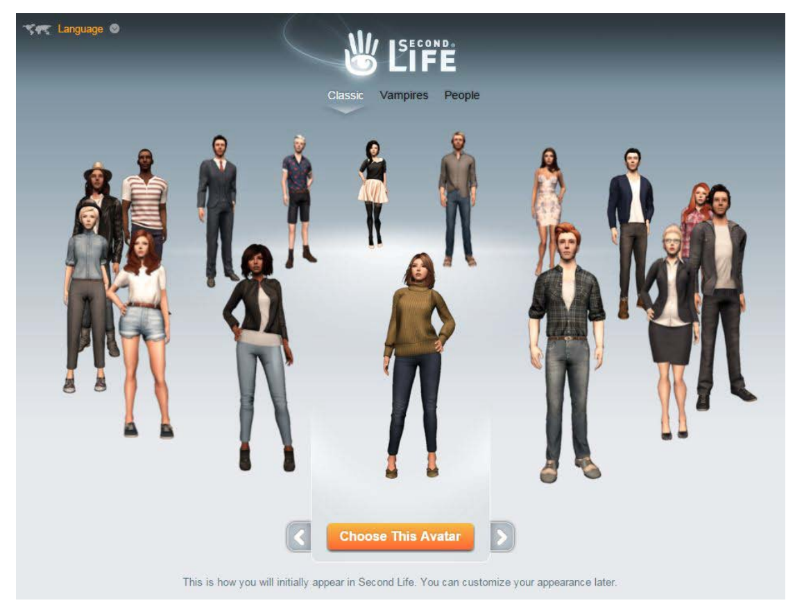
Figure 4. Avatars from Second Life.

Finally, and quite archetypically with regard to the (re)tracing process, in the movie Hangover we encounter a group of four friends in escapist adventures whose collective imaginary has been gripped (repetitively so, at least in the first two parts of the trilogy) by an arche-trace that has been obliterated beneath the signs and that must be recuperated by retracing them. The retracing process consists of extreme social situations, not necessarily connected to each other, that is spectral, self-contained fragments of a totalizing discourse that is imaginarily strewn at the fringes of the socially sanctioned roles that are otherwise performed by the heroes.