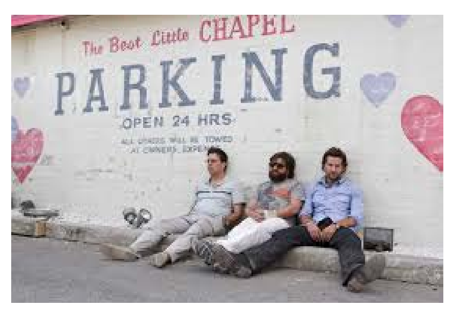
Figure 5. The Hangover wolfpack (minus the missing arche-trace) outside of the Chapel.

Drugs, in this instance, function as a reification of the bifurcated Platonic notion of pharmakon (as analyzed in Derrida's Dissemination), while being responsible for causing temporary memory loss. "The pharmakon is that double-edged word in Plato's text that causes the metaphysical oppositions to waver and oscillate" (Brogan 1989: 11; cf. Derrida 1981: 99), just like snake poison that that may be used for curing a bite, inasmuch as for effecting death. Here, pharmakon is accidentally disseminated as bad medicine, yet necessarily so in order to effect a collective lapsus (coupled with the audience's requisite regressus). The 'event' of lapsus is a necessary condition for the wolfpack's engaging in the economy of différance by becoming immersed in cultural differences beyond a good/evil dialectic whose meaning is constantly deferred while retracing differences as signs. The feats accomplished by the wolfpack in a state of lapsus constitute moments of a spectral semiotic economy where each social situation is enacted by automata who are neither living nor dead. They are not living as their actions, embedded in an 'imaginary world', run counter to the very symbolic structures that have allowed them to perform socially sanctioned roles thus far, and they are not dead since they are still biologically functional.