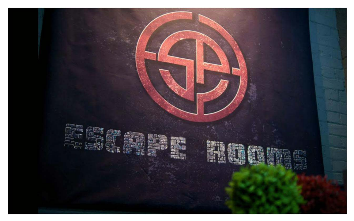
Figure 8. Escape rooms (London).

This is a reinscription of the Da Vinci code, albeit relieved from any ontotheological significance. Thus, "the spectrality of ghost/machine becomes a part of common experience" (Joseph 2001: 104). What binds groups of players in this social game in a social hauntological predicament is their mutual immersion in the process of retracing.