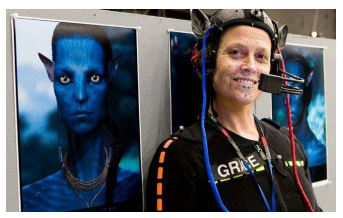
Figure 3. Sigourney Weaver as Avatar.