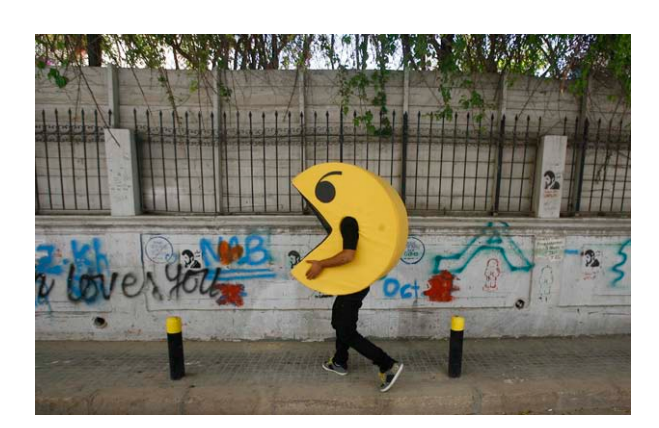
Figure 2. Urban pacman.