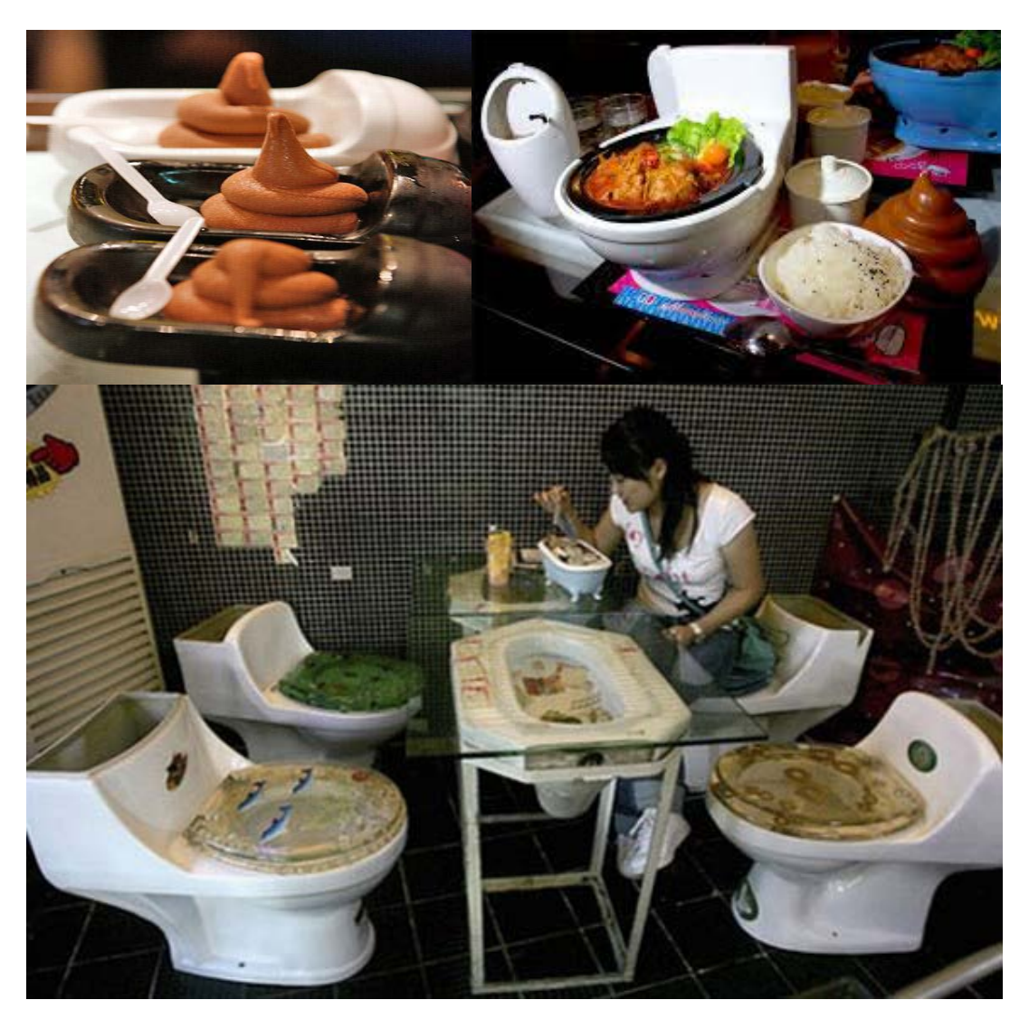
Figure 6. Toilet restaurant goodies.

the counter-movement of Hegelian shitting, of absolute knowledge as emptied subject.