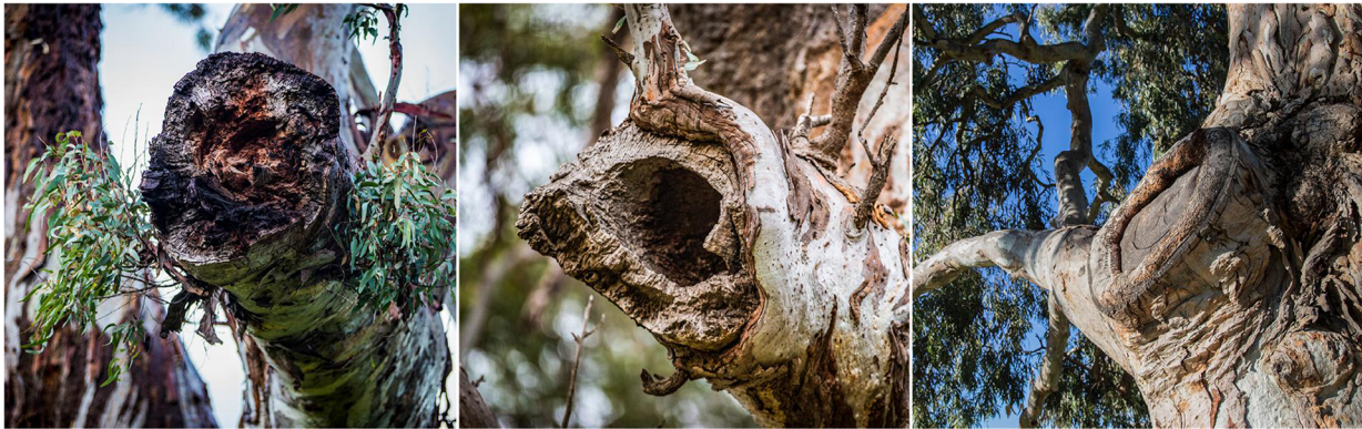
Fig. 4 A tree hollow's life history. Alternative histories of broken branches of river red gums. Left: initial state, a decaying branch. Middle: outcome one, after fungal and animal modification. Right: outcome two, with human modification

Such operations stop the formation of hollows, reducing their ecological benefits. Large old trees that have developed such cavities are crucially important because they provide valuable habitat features (Manning et al. 2012). Goldingay (2009) estimates that globally some 500 species of bats and 260 species of birds rely on tree cavities. Size and geometry of hollows (Fig. 5) determine who and how can occupy them, as listed below: