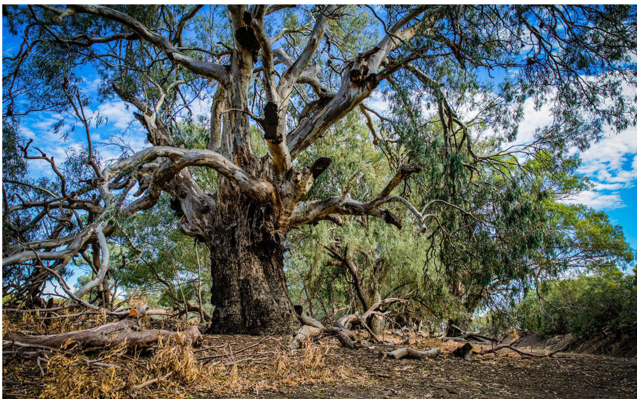
Fig. 1 A large old tree (river red gum, Eucalyptus camaldulensis ) and its habitat features. Top: canopy branches, deadwood, leaves, seeds and flowers. Middle: broken branches, hollows, rough bark and trunk fissures. Bottom: fallen leaves, bark, and branches

A tree's architecture is an arrangement of its parts at a given time. This arrangement expresses the state of interactions between plant growth and environmental conditions (Barthélémy and Caraglio 2007). All ecosystems transition through semi-stable states (Maser, Claridge, and Trappe 2008), mostly gradually but sometimes abruptly. Consequently, tree architecture reflects intrinsic patterns of growth combined with external impacts such as fires, insect outbreaks, fungal attacks and weather events. Such impacts lead to injuries, for example, broken branches or damaged bark. Injuries start processes of decay that result in habitable hollows (Lindenmayer 2009). Trees interact