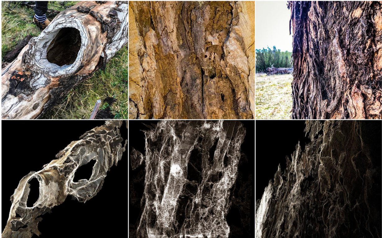
Fig. 8 Hollows and bark. Top: samples. Bottom: imaging outputs. Left: yellow box ( Eucalyptus melliodora ) tree hollow imaged with structured light photogrammetry. Middle: the internal surface of a hollow imaged with computed tomography. Right: rough bark of a yellow box imaged with structured light photogrammetry

of this category include costs, the need for expert knowledge and experience, time to set up, the need for specialist transport or auxiliary equipment, tolerance of equipment to field conditions, etc.