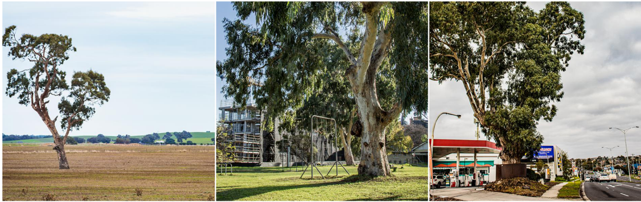
Fig. 2 Tree context. Left: a river red gum ( Eucalyptus camaldulensis ) within managed agricultural land. Middle: a river red gum in an urban park. Right: a river red gum among paved surfaces

with the surrounding lifeforms such as birds and bats that nest within cavities or insects that eat the foliage and burrow into the bark. Animals select hollows based on characteristics such as shape, orientation, entrance size and height from the ground (Le Roux et al. 2016). The resulting tree's geometry is a product of coevolution and complex historical relationships. It is distinctive in multiple ways, for example at genotype (or species) and phenotype (or individual) levels. Individual trees have unique life histories that are specific to the places they inhabit. Multi-species communities and individuals living in such places impact on tree biographies. In turn, trees affect all local life and abiotic conditions. Metabolic as well as cultural interactions of local lifeforms aggregate into distinct patterns that can be many thousands of years old, complex, rich, large or rare.