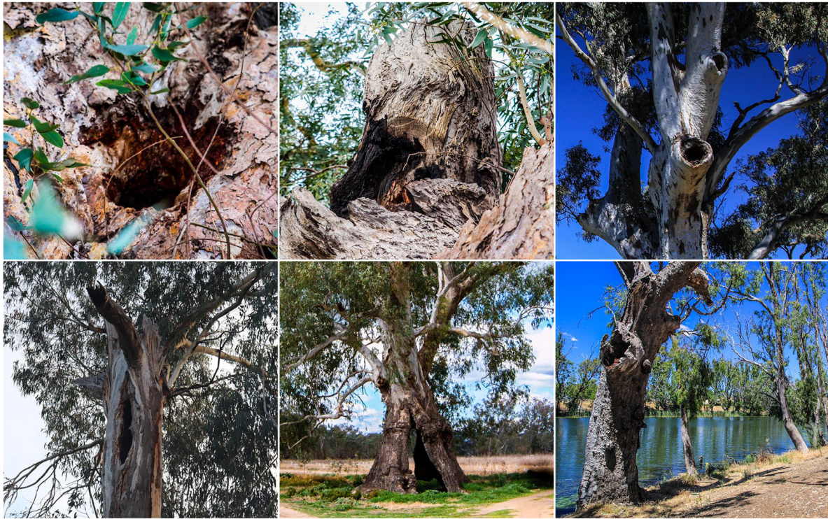
Fig. 5 Hollows in large old river red gums. Top left: a small cavity. Top middle: hollow from a lightning strike. Top right: a large hollow from fallen branches (image by Colin Judkins). Bottom left: a large fissure and a protruding hollow. Bottom middle: a root cavity enlarged by fire (image by Friends of the Albury Botanic Gardens). Bottom right: a snag with a large hollow and numerous entrances (image by Colin Judkins) (Source of all inattributed images: the authors)