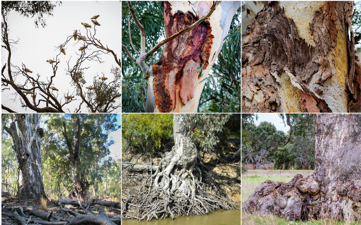
Fig. 3 Tree habitats. Examples of a range of supported by within river red gums. Top left: deadwood in the canopy. Top middle: damaged sapwood. Top right: rough bark. Bottom left: fallen limbs, bark and leaves in the understory Bottom middle: exposed roots. Bottom right: root buttresses

nutrients can further the understanding of ecological functions of trees, support their long-term management and inform designs of artificial replacements, where necessary. A selection of relevant tree features includes: