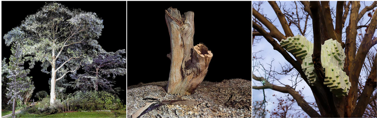
Fig. 6 Representations of hollows. Left: light detection and ranging scan of a large tree and its context. Middle: light detection and ranging scan of a hollow. Right: physical prototype of a prosthetic hollow by Dan Parker

This article focuses on three techniques: photogrammetry (passive), laser scanning (active) and computed tomography (active). Comparisons of such techniques already exist (Remondino 2011) and multiple techniques in combination often produce better outcomes (Ramos and Remondino 2015). This article follows this comparative work and aims to sample common and relatively accessible techniques in application to some characteristic challenges of more-than-human heritage as described above.