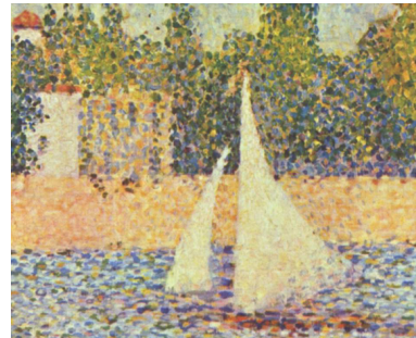
FIG. 2. She just dotted it with sparse quantum events.

God did not over-fill the world with moving waves on infinite dimensional configuration spaces. She didn’t even draw it with heavy continuous lines. She just dotted it with sparse quantum events.