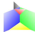
Figure 3. Spinfoam: the time evolution of a spin network.

In the covariant formalism (see [2]), transition amplitudes are defined order by order in a truncation on the number of degrees of freedom. At each order, a transition amplitude is determined by a spinfoam : a combinatorial structure \mathcal{C} defined by elementary faces joining on edges in turn joining on vertices (in turn, labeled by quantum numbers on faces and edges), as in Figure 3.