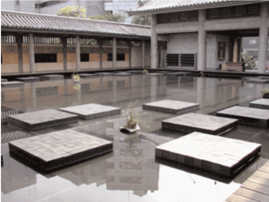
FIGURE 1: The “water garden” at Tōchōji.

of ¥800,000 ($7,400), which is roughly one-quarter the cost of a regular grave. Unlike traditional grave costs, this price includes the interment ceremony, yearly memorial rites, and space for one’s cremated remains for up to thirty-three years, the length of time for which individuals are traditionally memorialized before becoming anonymous “ancestors.”