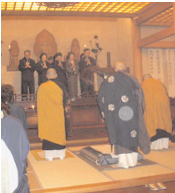
FIGURE 3: The precepts ceremony ( jukai shiki ).

vows, the finale, when the new members are standing atop the dias with the priests and other members bowing before them is an undeniably powerful moment that none of them has ever experienced in a temple before (FIGURE 3). 38 It is also vital to note here that, for almost all lay Japanese, including the danka of Tōchōji, the Buddhist name, kaimyō , along with precepts, are given posthumously. 39 For laity to actually take the precepts while still alive is extremely rare, even in a shortened ceremony such as that offered by Tōchōji.