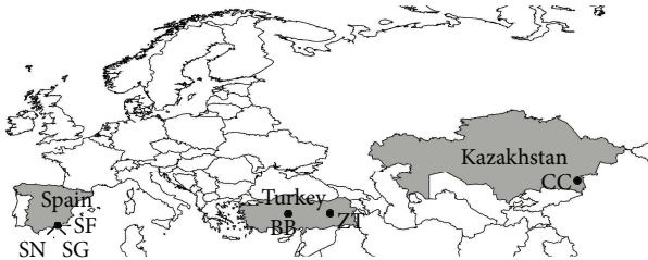
FIGURE 1: Distribution of the studied species: Spain (with three Rossomyrmex minuchae populations: SN = Sierra Nevada, SG = Sierra de Gador, and SF = Sierra de Filabres), Turkey (with two R. anatolicus populations: BB = Belebaci Beli, ZT = Ziyaret Tepesi), and Kazakhstan (one R. quadratinodum population: CC = Charyn Canyon) (from [20]).

parasite-host pairs live mostly in extended plains whereas the Spanish pair R. minuchae Tinaut 1981— P. longiseta Collingwood 1978 inhabits the top of three high mountains in southern Spain (Figure 1). Despite this apparent difference in habitat (extended plains versus high mountains), the abiotic conditions are quite similar and are consistent with a typical arid steppe [7, 18, 19]. However, the main difference comes from the fact that the Spanish populations are small and are geographically isolated from each other [20].