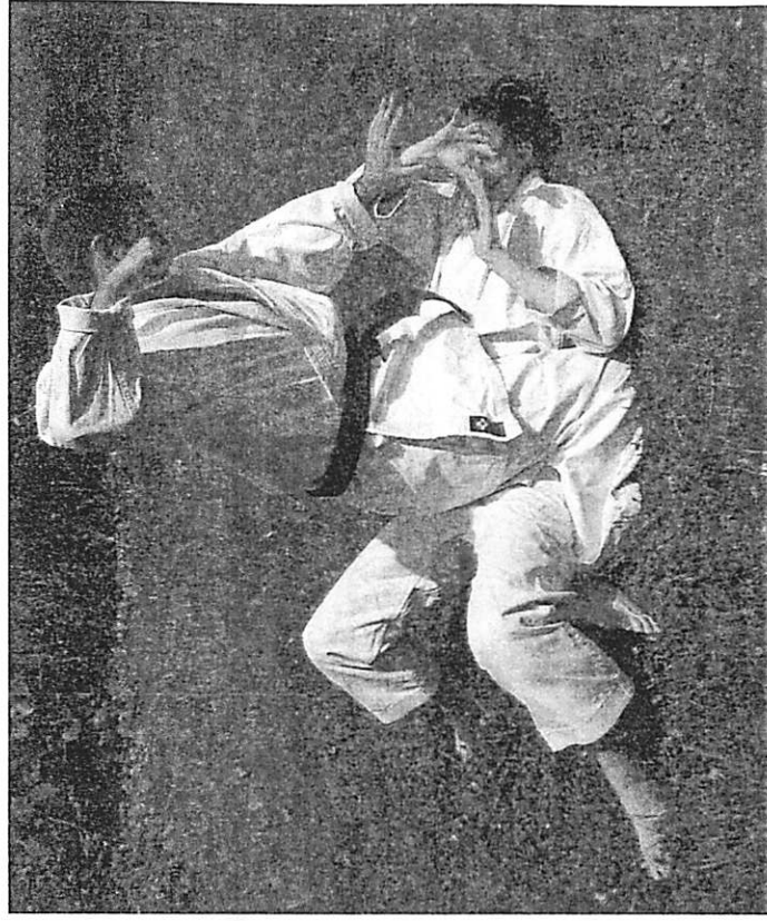
Our! But Chuck Norris said it would work!

It's not just other physical activities where history is kept in its place; the same is true in any well-developed area of study. It's not considered disrespectful for a physicist to say that Isaac Newton's theories are false. Newton is a giant among physicists, but since physics is a serious endeavor, epistemic deference to historical figures is not required, and the fact that Newton, or Einstein, or Aristotle, believed that such and such is not regarded as a reason to believe that such and such. (It's probably worth noting that amongst crank physicists the authority of certain dashing figures—especially Einstein, Bohr, Feynman, and Hawking—is given more weight, and they may write as if the "Hawking thinks such and such, therefore such and such" inference is likely to go through, just as I occasionally meet people at parties who think "Chuck Norris thinks such and such, therefore such and such" is a persuasive argument in the martial arts.)