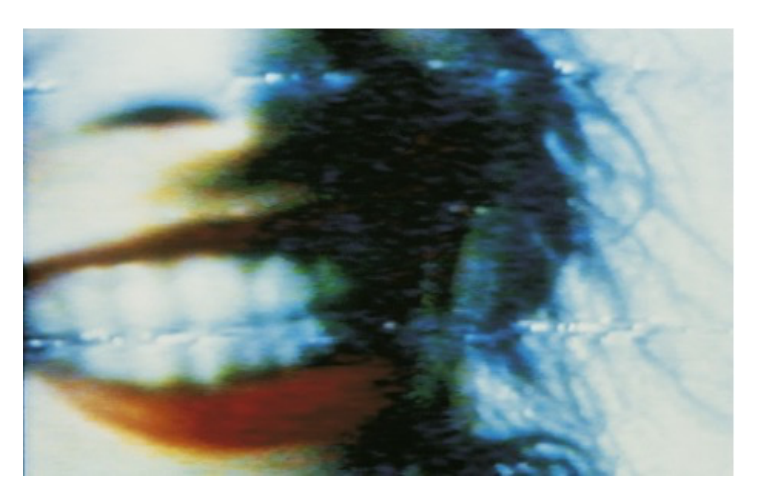
Figure 1. Pipilotti Rist, I'm Not The Girl Who Misses Much, 1986. Video (video still), © Pipilotti Rist, Courtesy the artist, Hauser & Wirth and Luhring Augustine

The following exemplary analysis of a video by the well-known Swiss video artist Pipilotti Rist is intended to show the extent to which the arts are not only concerned with revealing processes of perception and formation and their effects, but also with provoking reactions (Sauer 2012b). This is a video that the artist realized in 1986 during her formative years at the Basel Kunstgewerbeschule, now the Academy of Art and Design, and through which she became known at a stroke: I'm Not The Girl Who Misses Much (Fig. 1).