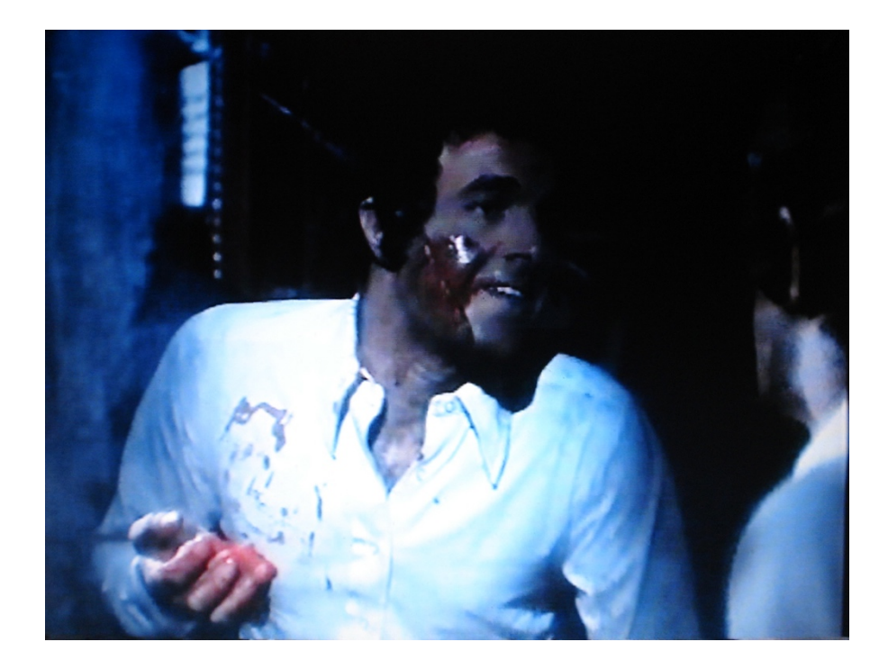
2. The final scene from The Gambler . Axel admires the wound that confirms his proximity to the real of chance

player far from the authority, values, and influence of the real world' to drift towards 'the sacred' (Caillois, 2001: 75-76). And for the sacred we might read the other-than-human, the inhuman or, even, incalculable chance, which becomes for our gambler more tangible than the world in which things are fixed and predictable.