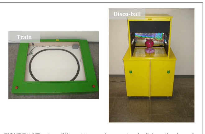
FIGURE 1 | The two different types of apparatus ( collaboration boxes ) used for the problem-solving task in Phase 2 (left: train box , right: disco-ball box ).

In Phase 3, two additional boxes were uncovered. These two new boxes were identical to the first box; the only difference being that children could activate the toys inside the boxes individually ( individual play boxes ). The individual train boxes had red buttons mounted closer together allowing children to activate the train individually. The individual disco-ball boxes had no Plexiglas divider preventing children from triggering the disco ball inside individually. The general setup of Phase 2 and Phase 3 is also illustrated in Figure 2 .