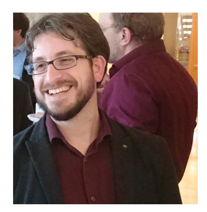
| by RENAUD EVRARD PA President

is diversity, which inherently involves recognizing marginalized voices. Marginality is type of liminality, and the liminal are often marginalized (Hansen, 2001). Within these pages, we are attempting to bring together topics which go beyond the mainstream. These are often supported by those who have low or no status because of their identity. And they teach us something of the paranormal, as it appears to feed on social groups with specific anti-structural characteristics (Evrard, 2010).