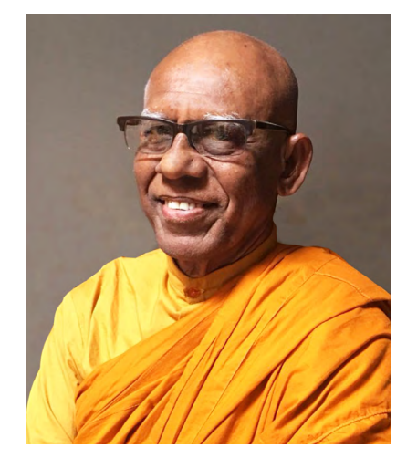
| by VEN. BHIKKHU MIHITA, Extra-Sensory Perception Bared

The myth behind the understanding of ESP in Western science is that humans only have five senses, and that the human mindbody is constituted of only the physical senses. But the reality is that the human mindbody has a sixth sense, namely the mind sense . In fact, this is not the sixth sense, but the very first. The Buddhadhamma ("Teachings of the Buddha," distinct from the