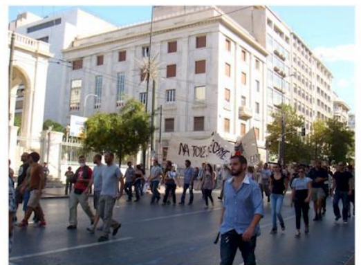
18 October 2012: general strike

In Syntagma Square, the atmosphere was menacing. Riot police were out in force. The air was full of chemicals. I felt some itching in my eyes, nose and throat, but I didn't get the worst of it. A bloc of professors had got the worst of it.