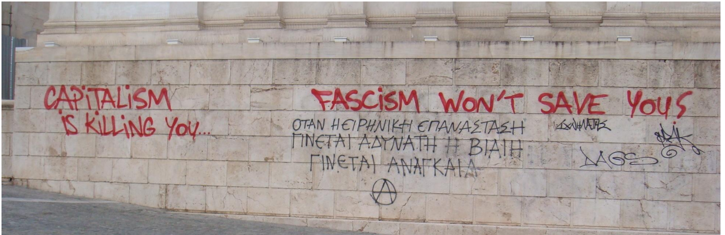
At the Academy of Athens