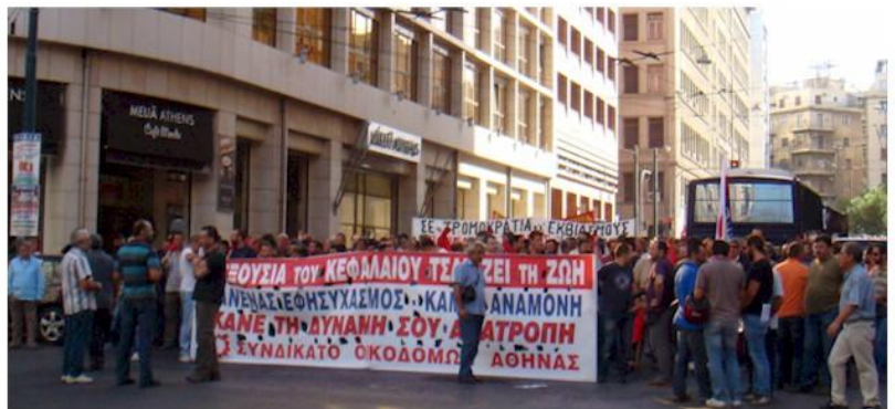
The KKE on the streets