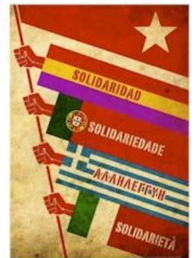
14 November 2012 in Dublin, but mostly elsewhere in Europe

On the day someone tweeted: “This little piggy didn’t come out to strike.” I had been noticing that PIIGS was increasingly being spelled PIGS. It seemed that the narrative of Irish exceptionalism, promoted both by our government and the troika, was prevailing, even among the international left, who sometimes don't rate us as part of a common struggle. We are trying, even if we fail to mobilise in such numbers, partly because our fellow citizens do not see that what is being tested in Greece is what is in store for the rest of us. The lowering of wages, the shrinking of social welfare, the privatising of public assets are not meant to be temporary measures. They are core to the restructuring of capitalism well underway in Ireland and elsewhere.