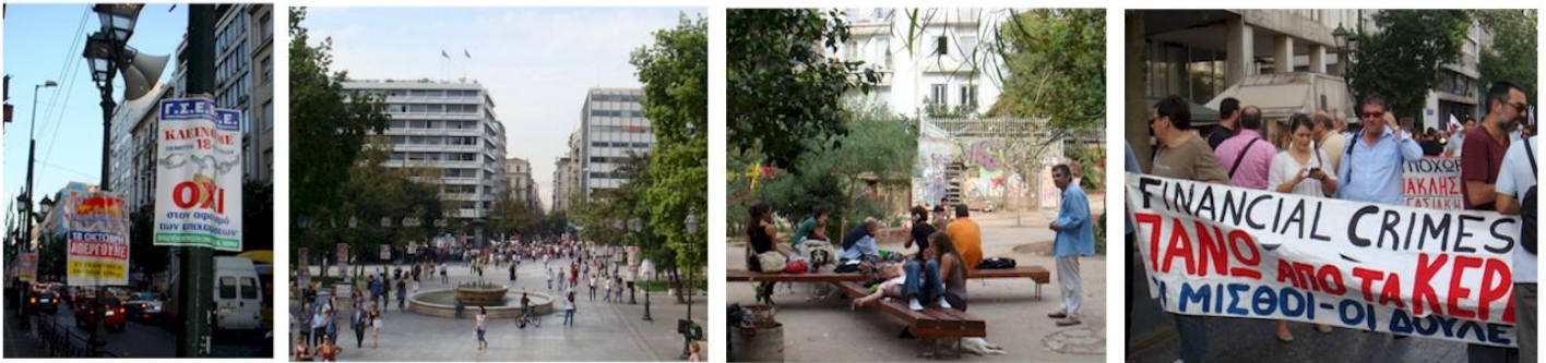
Athens in October 2012

move it on to another level, but they know it cannot go on as it is. For others, hope is clearer and stronger, although not without doubt and not without a sense of nearly overwhelming forces that could swamp all their best efforts. These are the ones who are not only critiquing and resisting, but also strategising and organising for a social transformation that would chart a path out of the crisis, ultimately a new path out of capitalism and to socialism. Conscious of all previous attempts that have crashed and burned or have betrayed the hopes they engendered, they are sober about their chances, but determined in their work.