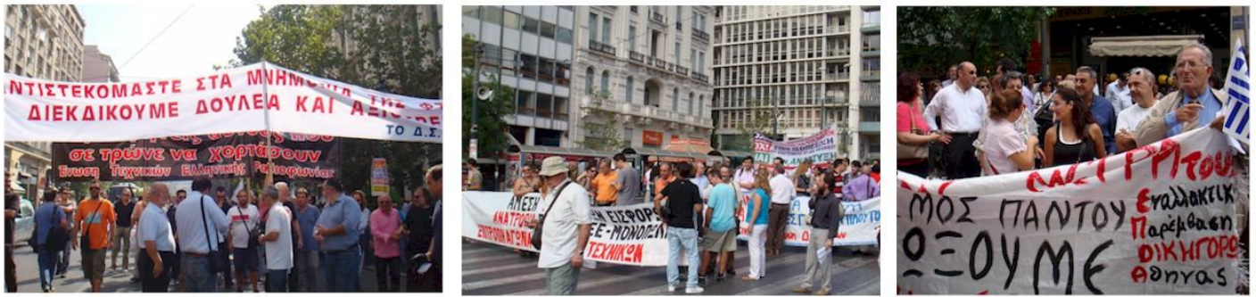
17 October 2012: journalists on 24 hour strike, while doctors, pharmacists, dentists, lawyers on 48 hour strike

Life has become menacing on so many levels. Even insect bites are no longer just irritating, but now threatening, as malaria has returned to Greece. Although the solidarity networks and protests have brought an enhanced sense of community, there have been countervailing patterns in evidence too, as people push and even trample each other for free food supplies. Desperation surrounds food. People are asked to put stale bread and other still edible food in bags hanging on the outside of bins to save scavenging and contamination. The bags disappear quickly. I was surprised at how many men I saw fingering worry beads. I had associated these with very old men in kafeneions on islands, but saw young men walking the city streets with them, including a riot cop on duty.