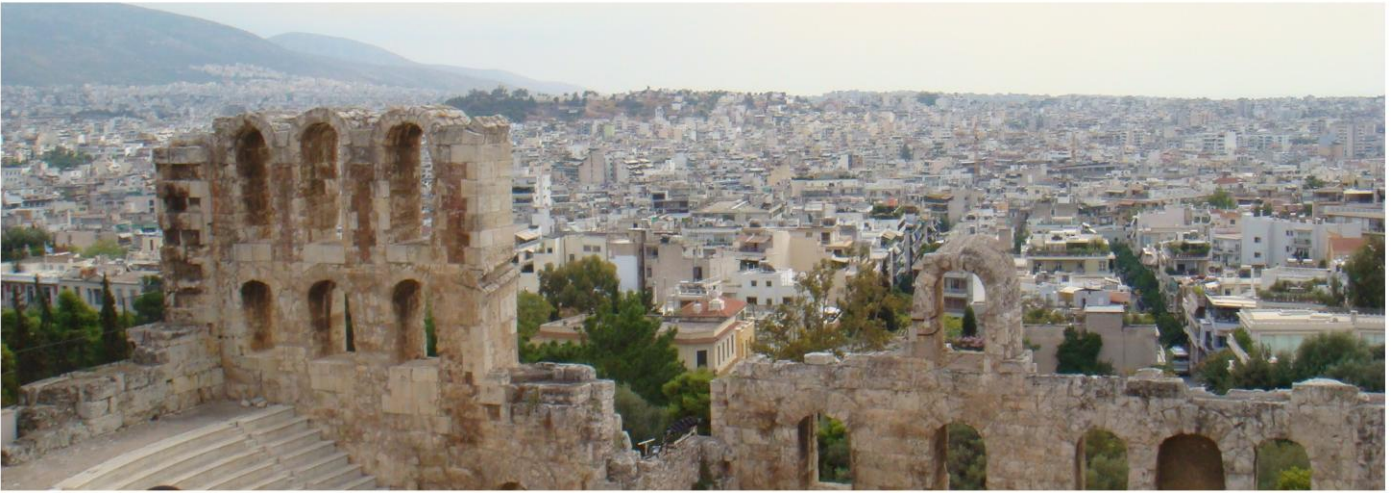
View of Athens from the Acropolis

In my times alone I read novels that I hoped would thicken my sense of Greek history, as I have during all my previous trips to Greece. Some were disappointing, but The Thread by Victoria Hislop and The House on Paradise Street by Sofka Zinovieff definitely added time and texture to my vista.